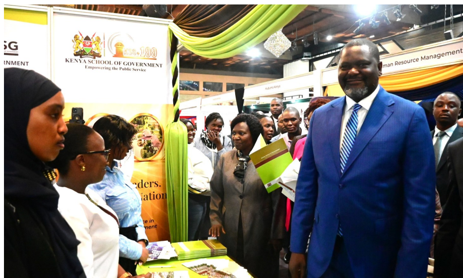
Cabinet Secretary for Public Service, Human Capital Development and Special Programs Hon. Geoffrey Kiringa Ruku, at the KSG exhibition booth.

The choice of water and sanitation as the central focus