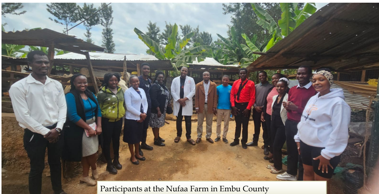
Participants at the Nufaa Farm in Embu County