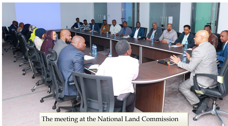
The meeting at the National Land Commission