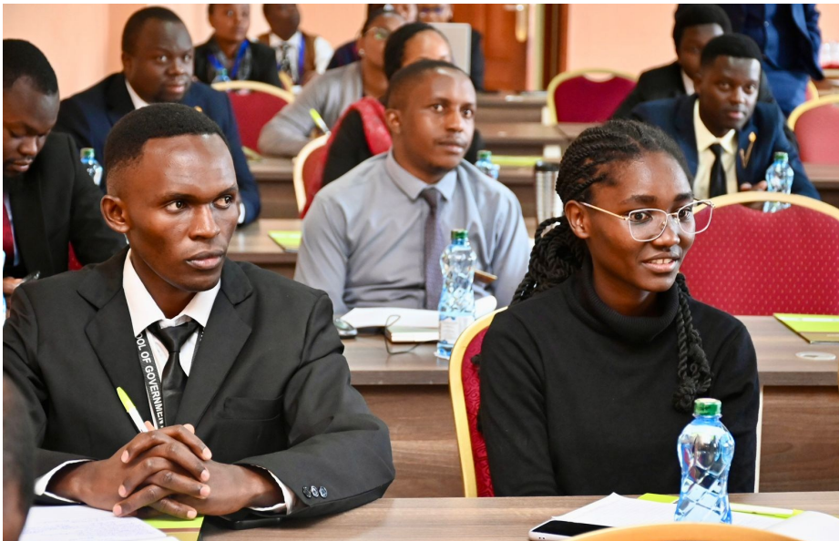
Delegates at the Conference comprised a rich blend of seasoned professionals and young, and new entrants at the School.

A structured national research conference calendar would be developed to institutionalize consistency and coordination in research dissemination. The draft Research Policy and Guidelines will be finalized, approved, and to guide institutional research practice across the School.