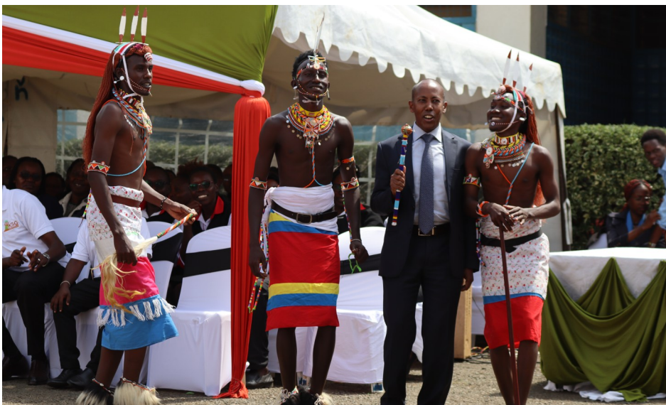
KSG Director General received in style at the ceremony.

As KSG celebrates 100 years since its establishment in July this year, this alliance with Huduma Kenya signals renewed focus on modernization of operations for the benefit of the citizen. It is the meeting point of knowledge, technology, and proximity – where public service becomes more present in everyday life, not distant or occasional.