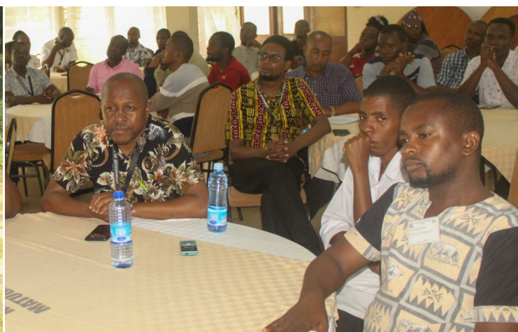
Left: Directors and members of staff on a tour of Matuga Campus. Right: staff at the meeting held between them and the Directors.