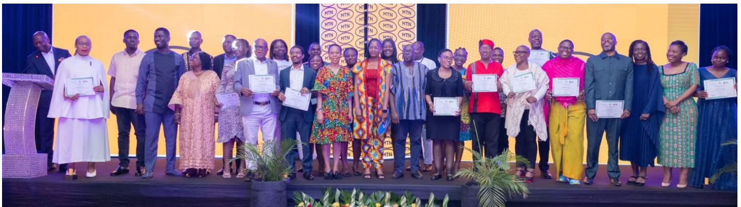
Senior officials, legislators and policy practitioners from Kenya, Ghana and South Africa who attended the Economic Governance – Policy, Practice, and Integration for Inclusive Growth in Africa Module.

Modules two and three of this programme will be held in South Africa and Kenya respectively.