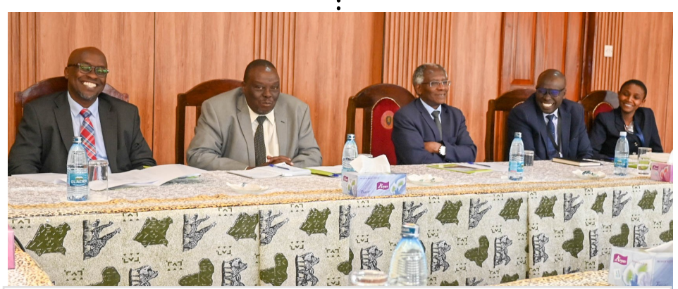
A section of senior members of staff at the meeting with the PS.

The visit provided opportunity for the PS to tour KSG's Security Management Institute, the Institute for Gender and Social Development and the e-Learning Development Institute allowing for direct engagement with staff and some of the participants.