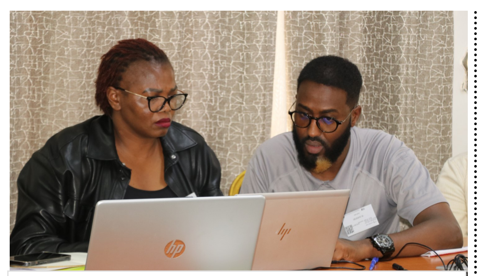
Participants attending the eGP system training taking part in interactive discussions during a session focused on the Annual Procurement Plan (APP) Module.