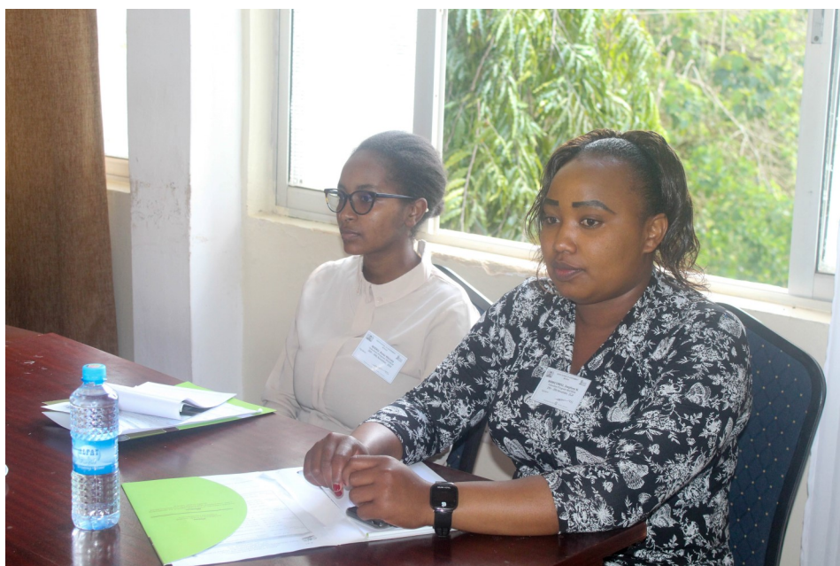
Pest Control Products Board (PCPB), new recruits during their Induction Course in Matuga Campus.