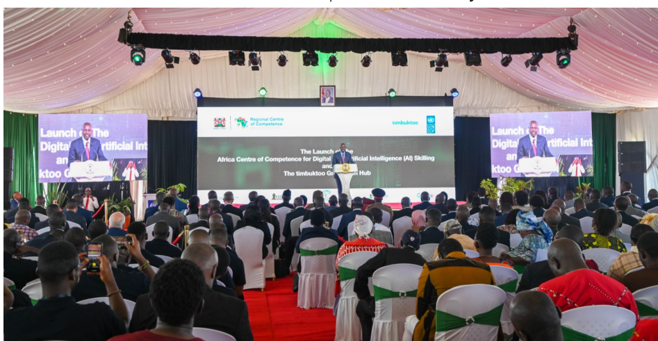
Delegates follow proceedings at the launch.