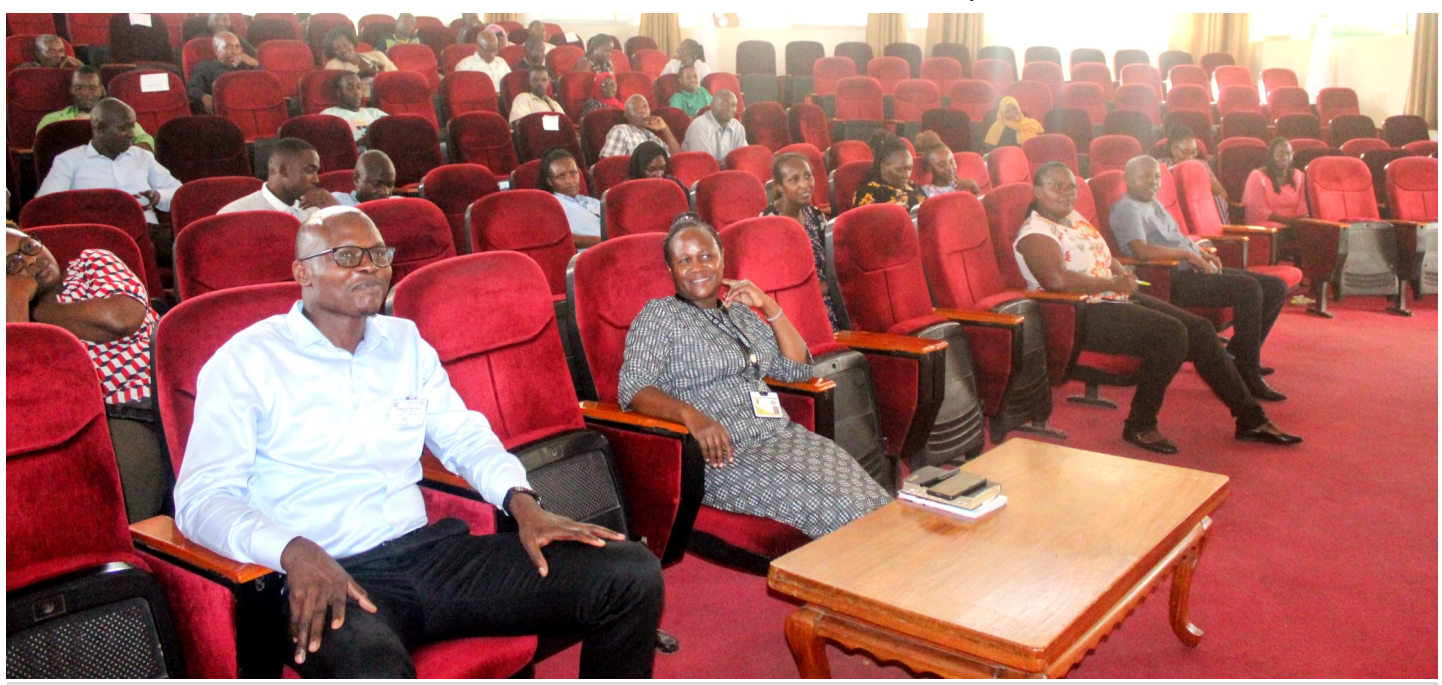
Congregants at the prayer meeting at the Matuga Campus.

motivated and rejuvenated staff improved business, and greater impact on the governance space through training, consultancy, and research.