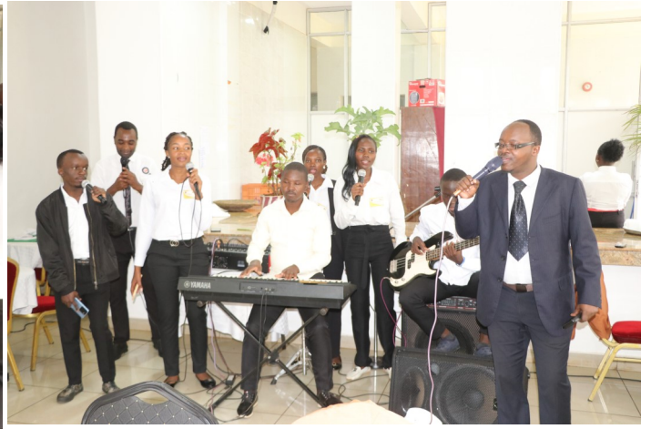
On Jamhuri Day, the Embu Choir captivated the Governor, H.E. Cecily Mbarire and her team with lively and entertaining performances at a breakfast held at the Campus.