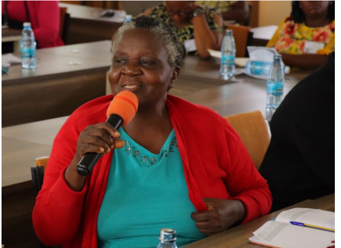
A public debate, themed "Security for Sustainable Development in Coastal Kenya: Collaborative Strategies for Stability and Growth," was held today at KSG Mombasa Campus. The event was officially opened by Mr. Mohamed Hassan, HSC, County Commissioner Mombasa. The forum brought together key stakeholders to deliberate on innovative approaches to enhancing security as a foundation for sustainable development in the coastal region, highlighting the importance of collaborative efforts for regional stability and growth.