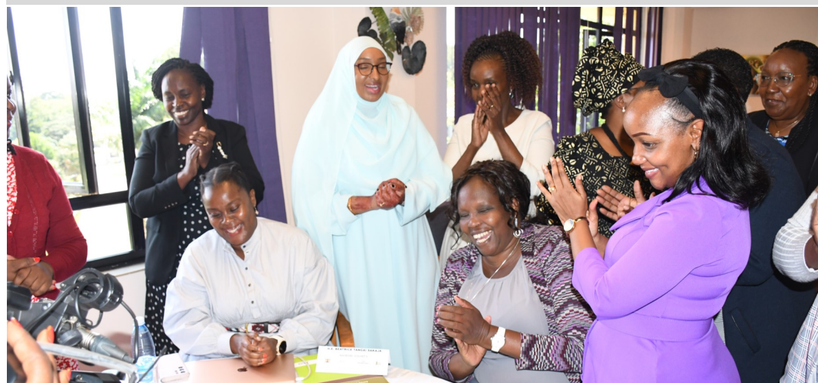
Participants share a light moment during one of the practical sessions in the leadership program. The weeklong program took place at the School from November 18-21, 2024.