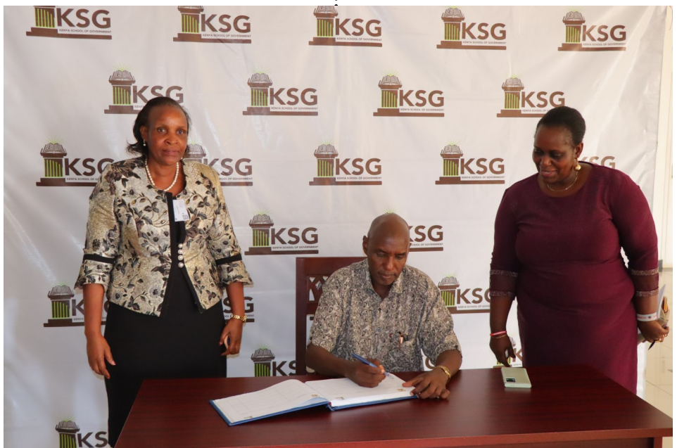
The PS pens his signature on the visitors book upon arrival at the Campus for the official closing of the Retirement Planning Course.

The course provides answers to questions such as making investments that will increase your net and social worth and wealth, pursuing your purpose and dealing with unforeseen circumstances.