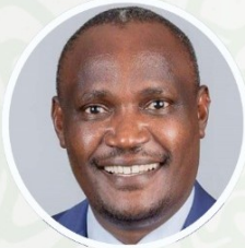
Hon. CPA John Ng'ong'o Mbadi, EGH Cabinet Secretary, National Treasury & Economic Planning

Sarova Whitesands Spa & Beach Resort Hotel, Mombasa