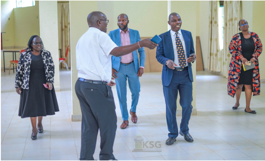
A site visit of the proposed Kisumu KSG Campus

government institutions at national and county levels.