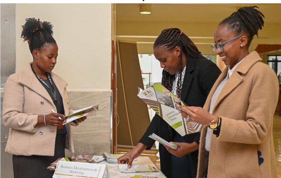
Staff engaged at Business Development and Marketing desk that was APS-HRMnet talks.

With a platform for learning from one another, exchanging best practices, and providing mutual support, HR practitioners will be better equipped to address the challenges of contemporary public service. The Kenya Chapter aims to raise the bar for service delivery and significantly contribute to achieving Africa's development objectives with the support of esteemed organizations such as the Kenya School of Government.