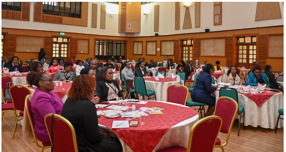
The Kenya Chapter of the African Public Sector-Human Resource Management Network participants follow proceedings