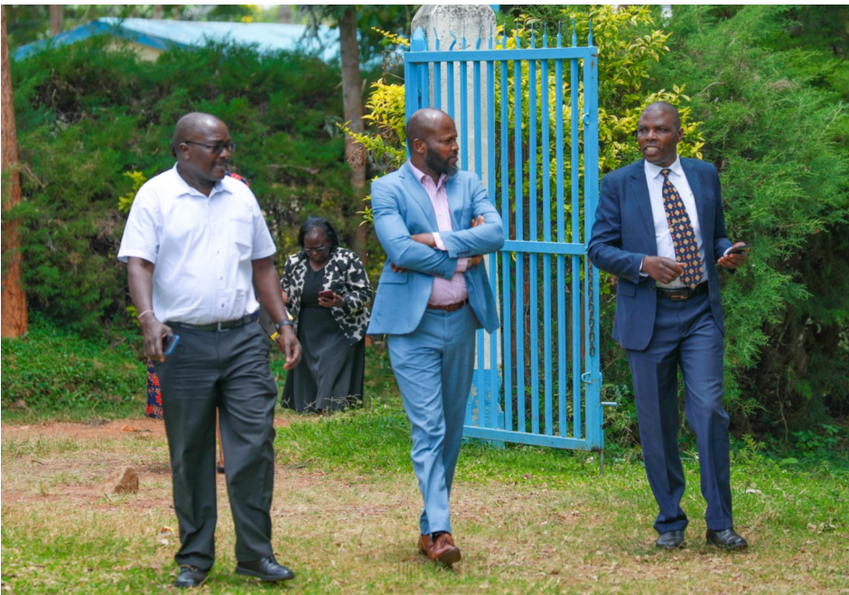
The delegation takes a tour of the facility

It will bring KSG services closer to the region. It will also benefit other neighbouring Counties for workshops and seminars. It will boast modern facilities, including a conference centre, hostels, dining facilities, and ICT equipment, enabling it to offer services at the highest standards. Besides, the residents stands to benefit from beaming of activities socioeconomically.