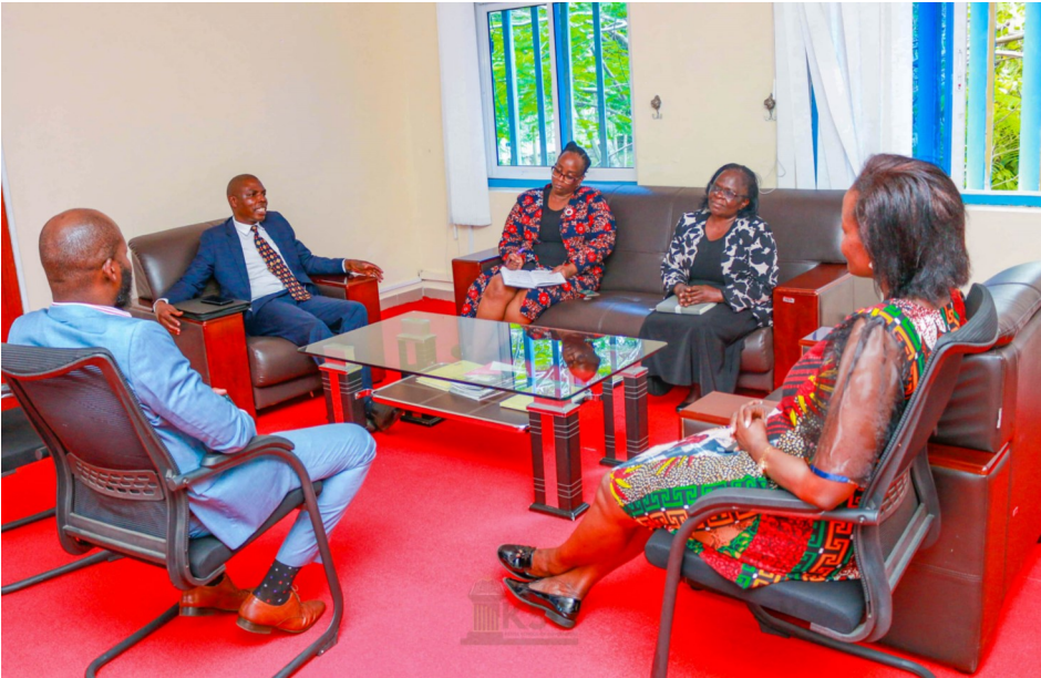
KSG and Kisumu teams at the deliberations

Kisumu County is seeking to implement its Human Resource Training Policy through the KSG's intervention in crafting training and consultancy solutions to strengthen its capacity to sustainably realize the County Integrated Development Plan (CIDP), and Prof. Nyong'o's Manifesto.