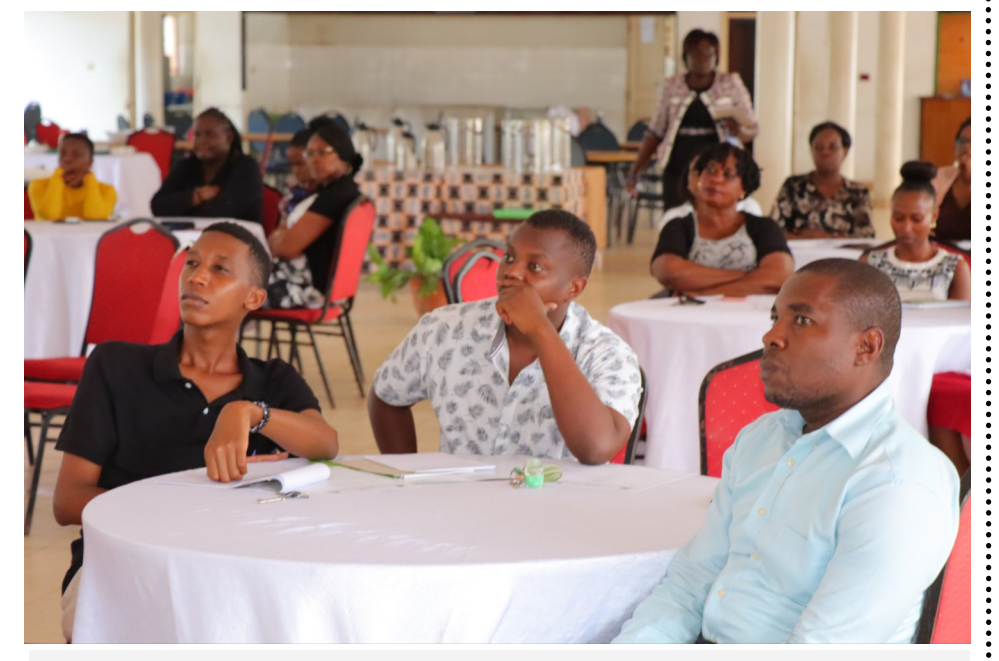
A section of staff follow proceedings during road safety lecture

NTSA's efforts, coupled public with increased awareness and participation, offer hope that the tide can be turned in the fight against road accidents. With continued commitment and collaboration. Kenya can move closer to a future where road deaths are no longer a daily tragedy but a rare occurrence.