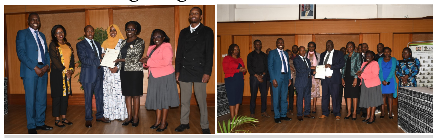
Directorate of Linkages and Collaboration (left) and the E-Learning Development Institute (right) display their signed Performance Contracts