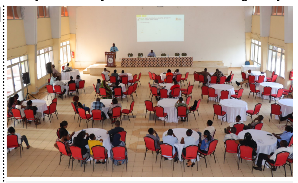
Aerial view of Mombasa Campus staff during the public Lecture by NTSA

Mr. Musumba emphasized the daily toll of road accidents, equating it to the crash of ten jumbo jets every day. "Imagine