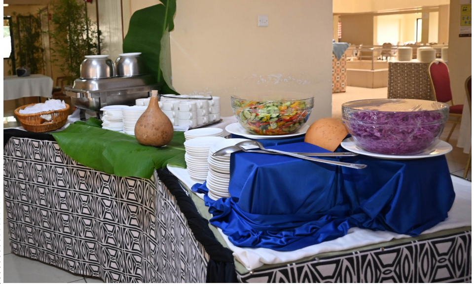
A set up at the Margaret Kobia Dining Hall by the Hospitality Department in celebration of the Abaluhya Community

Reports indicate the existence of eighteen sub-Luhya dialects within the Luhya-speaking