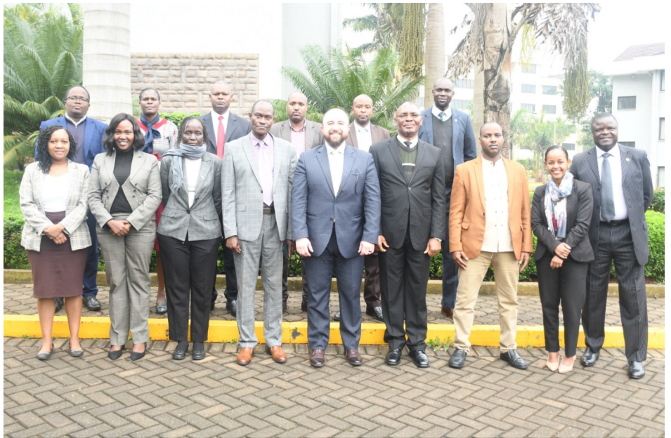
Participants from government and private entities at the multi-stakeholder forum held at the Kenya School of Government.

The agencies convened the first multi-stakeholder forum bringing together 26 government and private entities at the Kenya School of Government on May 29 to 31, 2023. As a result, a national roadmap was developed with recommendations to strengthen the capacity to protect vulnerable targets from terrorist threats in support of the implementation of UN Security Council resolutions. Subsequently, the NCTC co-hosted a follow up Strategic-Level