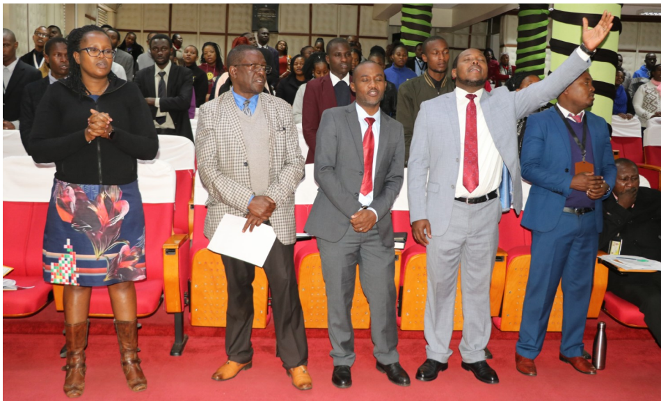
Staff and participants at KSG Embu joined together in prayer as they usher in the new financial year, 2024/2025