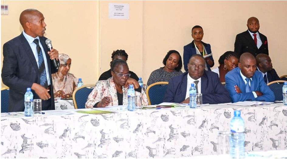
Staff of the Kenya School of Government during the meeting with the Somalia delegation.