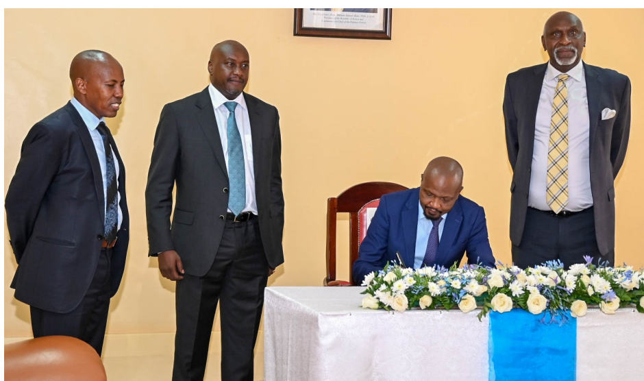
Cabinet Secretary Hon. Moses Kuria signs the visitors book upon arrival at Lower Kabete.