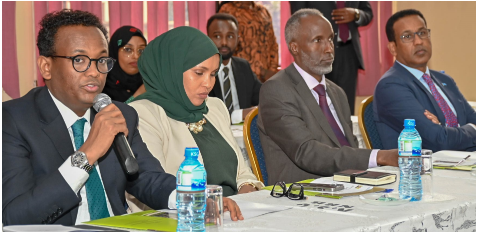
Federal Government of Somalia delegates during their visit at the School