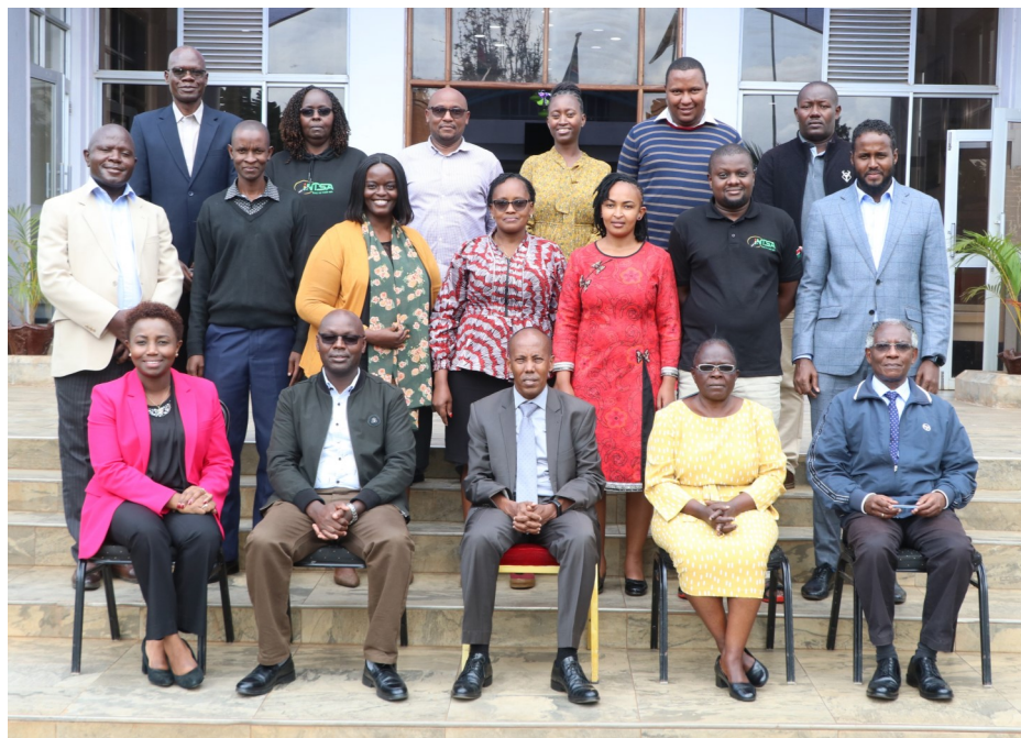
KSG and NTSA management and staff at the Action Planning Workshop at the Embu Campus on June 3-6, 2024. The workshop was to finalize on the programs designed for various stakeholders across the country to enhance road safety.

This represents just a fraction of the action on our roads and has raised concern on how to address the problem holistically and urgently; holistically for all stakeholders to be actively involved and urgently to speedily reduce the fatalities and deaths