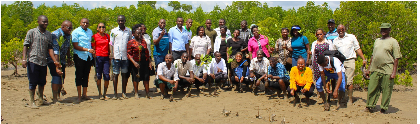
KSG Mombasa Campus staff and course participants take part in the rehabilitation and restoration of the mangroves at Mkupe, in Mombasa.

Every year, World Environment Day, celebrated on June 5th, provides a global platform to inform and stimulate action for environmental protection. The Kenya School of Government (KSG) continues to play a role in aligning programs and community outreach initiatives with this year's theme of "Ecosystem Restoration." KSG's involvement through its activities underscores the importance of translating environmental education into action and policy-making.