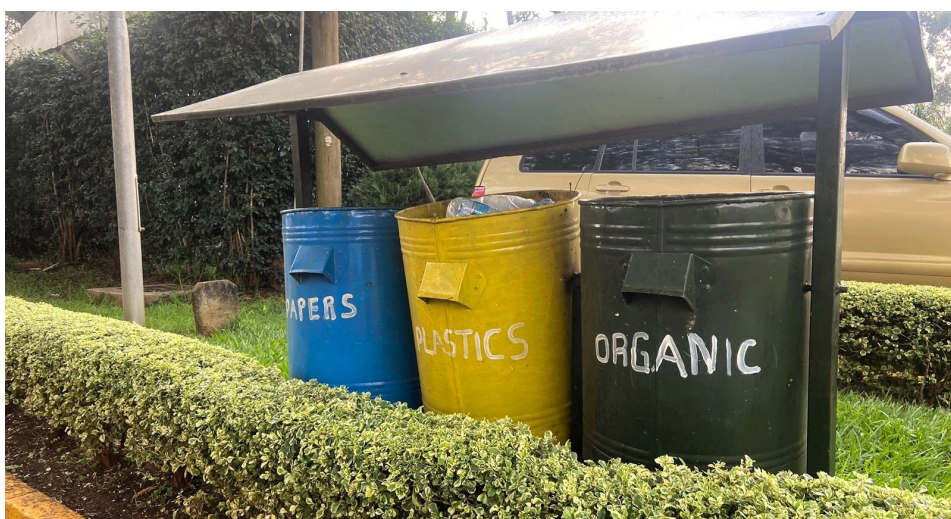
Waste segregation bins at Kenya School of Government, Lower Kabete.

Compiled by Esther Ndirangu and Gorette Nduku Centre of Environmental