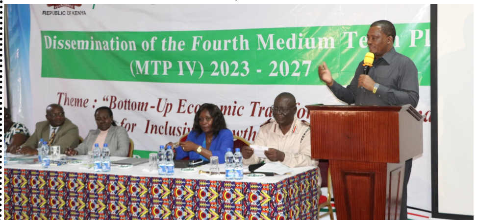
Hon. Justin Muturi, addresses delegates at the dissemination of MTP IV.

Amongst other actors, the Kenya School of Government can be relied upon to drive the Medium Term Plan IV from the standpoint of public service transformation. The School has a role to develop programs to articulate to public officials in strategic leadership position details of the MTP IV for social and economic transformation of the country and improvement of livelihoods. The programs should assist leaders to be able to align the policies and strategies of their institutions to the Medium Term Plans.