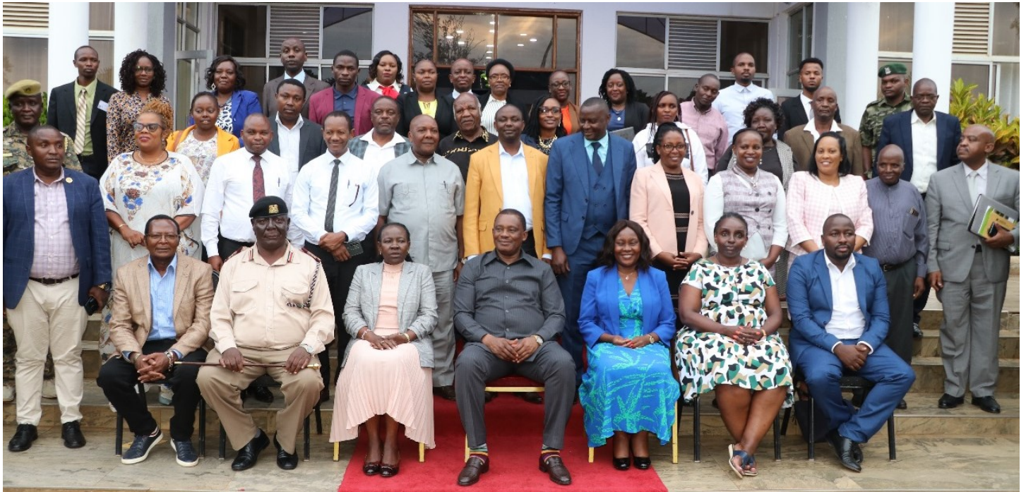
Attorney General, Hon. Justin Muturi (seated Centre) and Embu County Governor, Hon. Cecily Mbarire (3rd Right) together with delegates who attended the dissemination of the Medium Term Plan IV 2023–2027 at KSG Embu Campus.