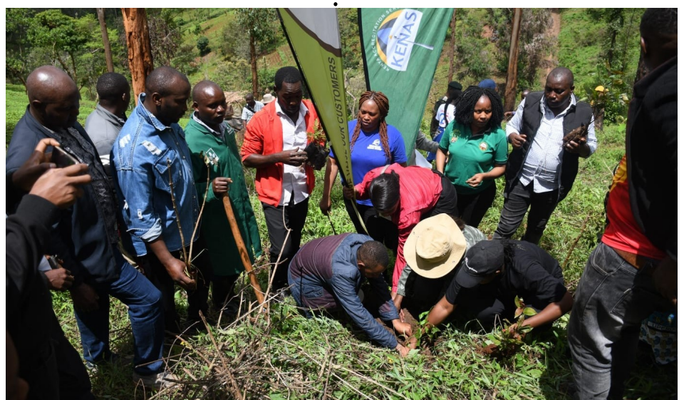
KSG Embu partners with Kenya Accreditation Service (KENAS) in tree planting at the Maranga Hills in Runyenjes.