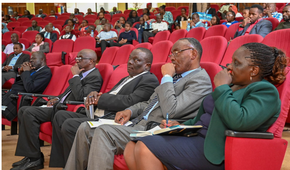
Delegates follow proceedings at the public lecture.

Council Chair, Justice (Rtd) Nyachae extended appreciation to the Chinese Embassy for their support, emphasizing the value of understanding China's history and culture in appreciating its transformation. He accentuated the pertinence of Kenya drawing upon China's rich historical practices as a valued resource in its endeavors to improve both its economic affluence and social development. Recognizing the