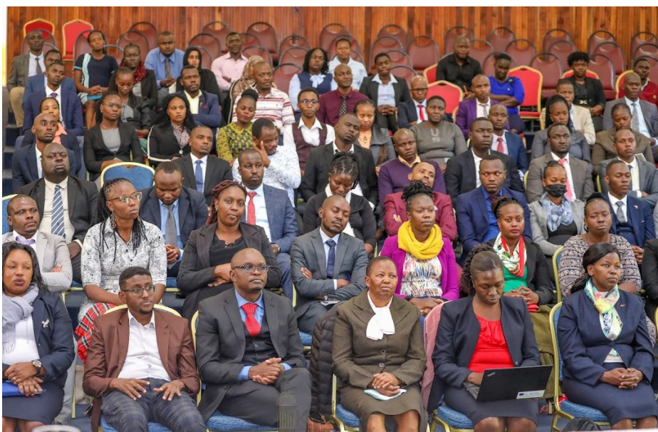
Inductees upon completion of their program at Baringo Campus

compromise their health, invest in themselves, and not forget the people who matter most in their lives.