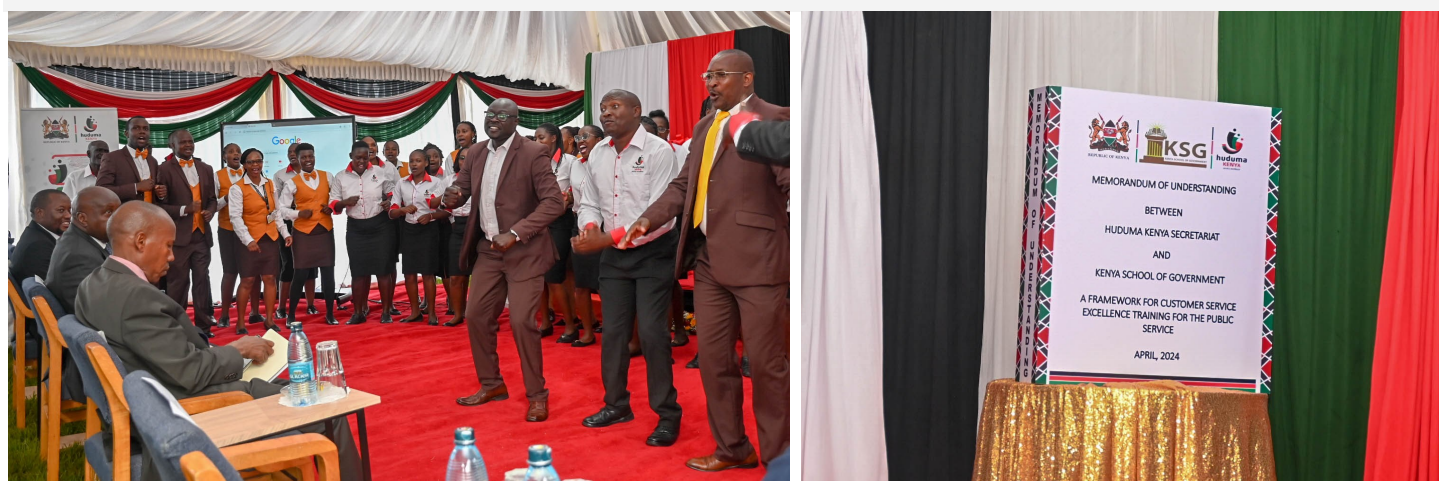
KSG and Huduma Kenya Choirs entertain the delegates at the MoU Signing. Right: The Memorandum of Understanding model unveiled.