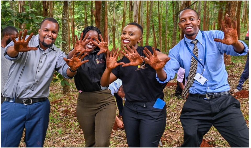
Staff from different departments at the tree planting event at KSG grounds. #KSGGoesGreen

has experienced extreme rain and flooding causing displacements, loss of lives and property and destruction in general.