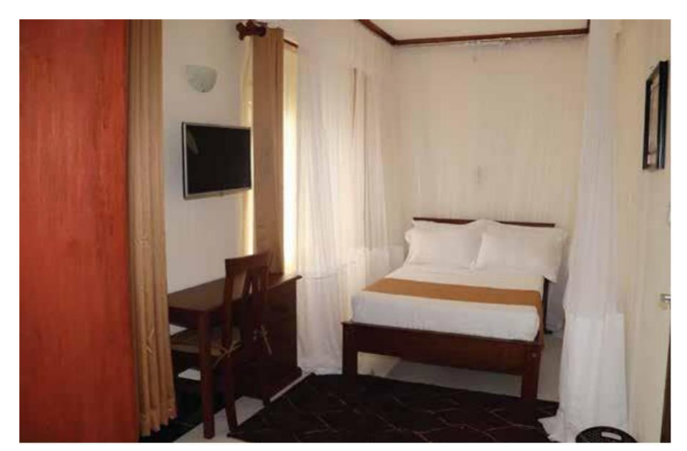
Cozy accommodation at Bahari Hostel