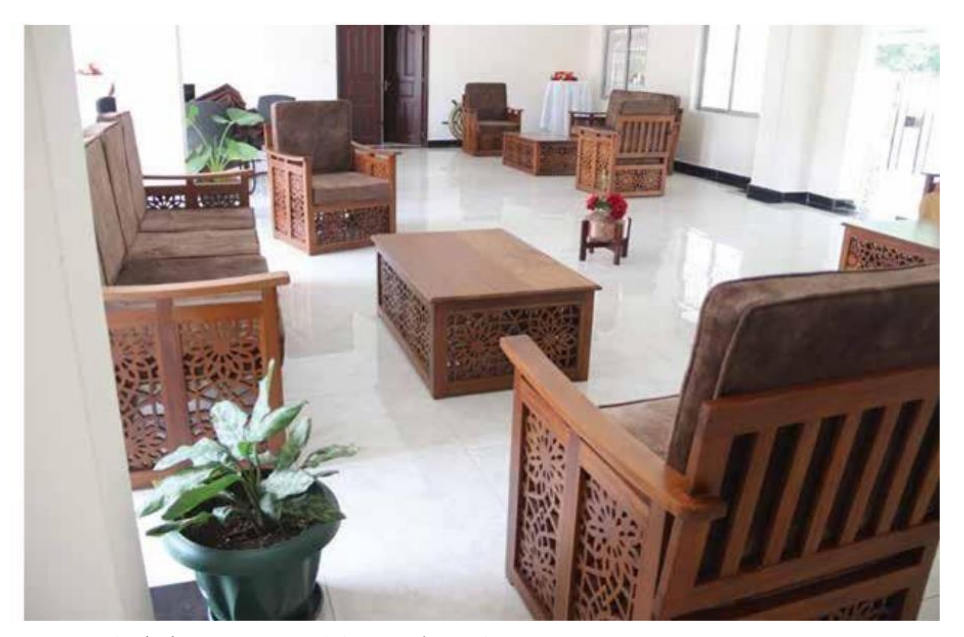
Lamu Styled Lounge at KSG Mombasa Campus