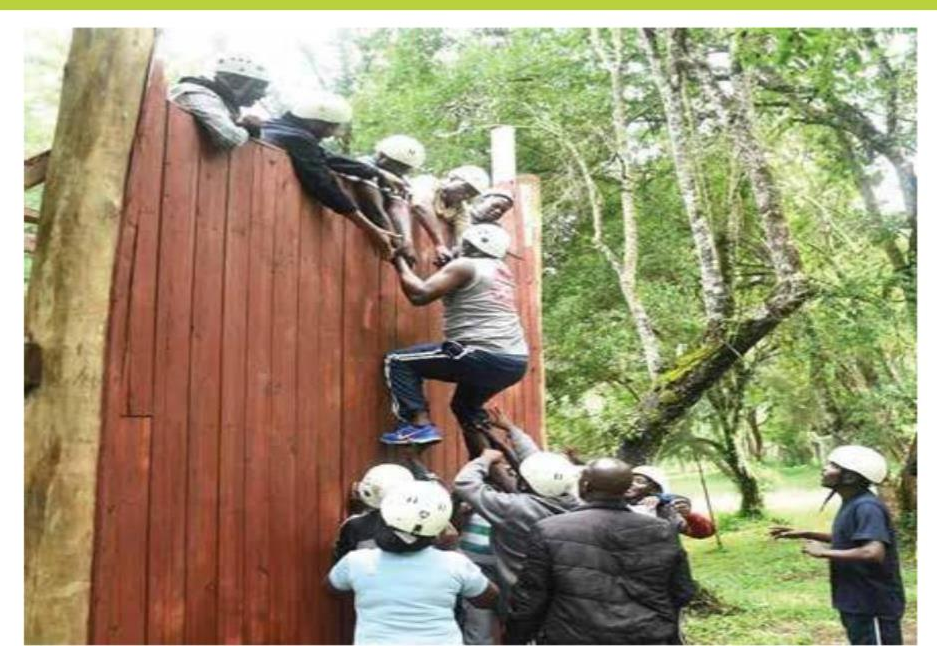
SLDP Participants undergo experiential learning