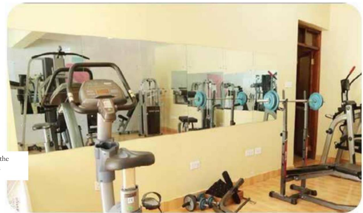
A well-equipped Gym at the KSG Baringo Campus