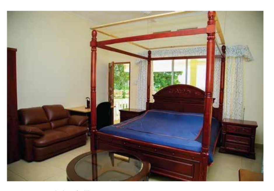
Accommodation facility at Matuga Campus