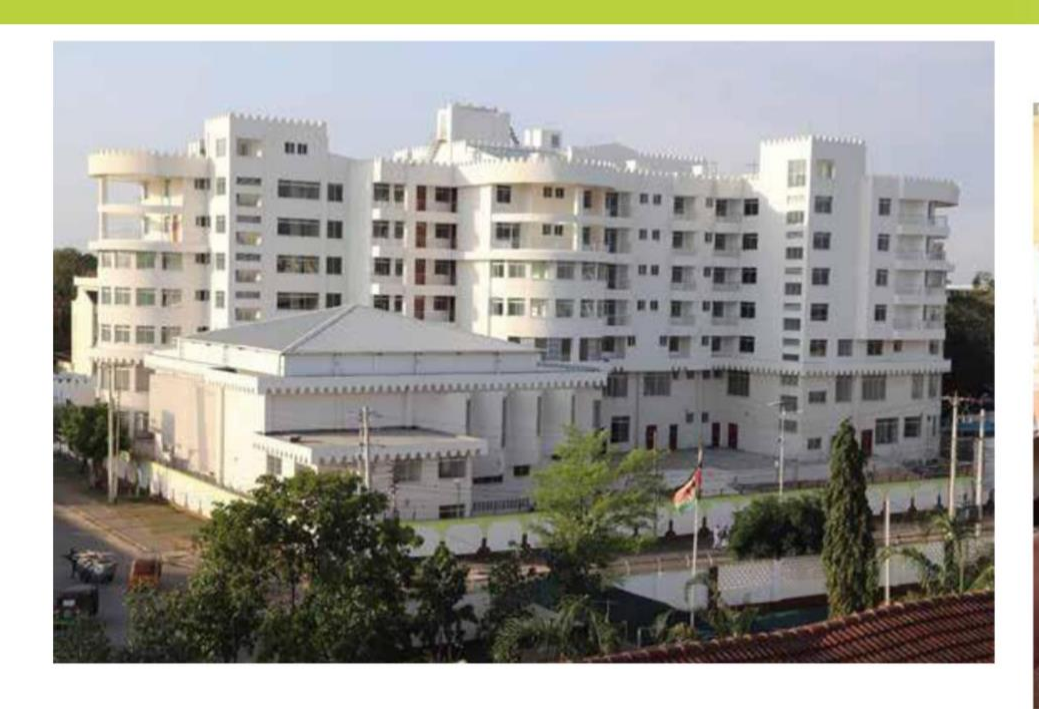
An ultra-modern conferencing and accommodation complex at KSG Mombasa campus