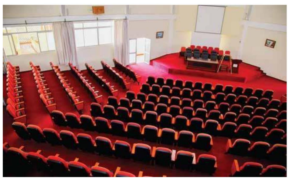
Excellent Conference facilities at the KSG Matuga Campus