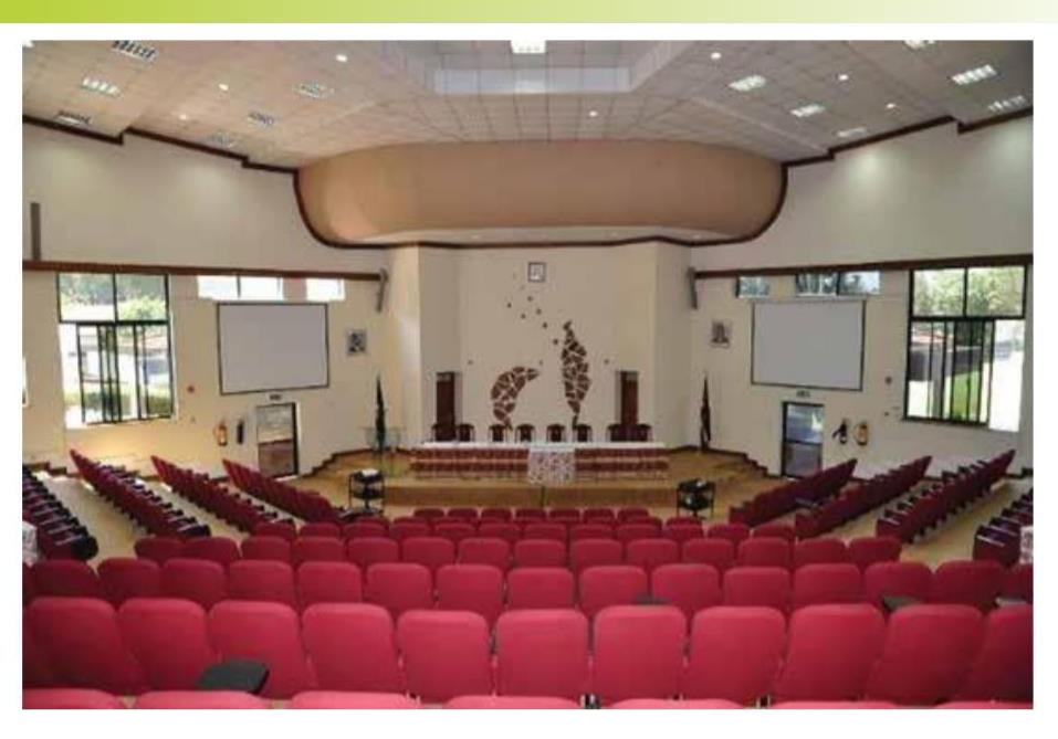
Conference Centre at KSG Lower Kabete