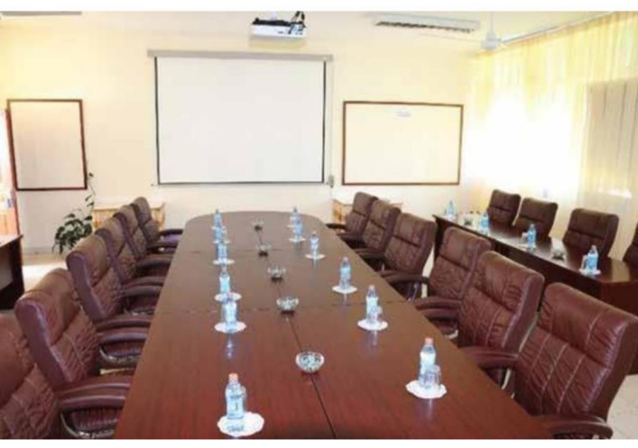
Executive Boardroom at KSG Mombasa Campus