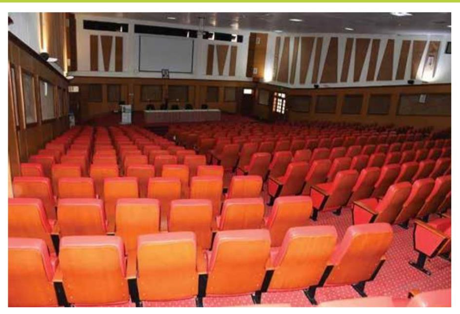
Auditorium Convention Centre at KSG Lower Kabete