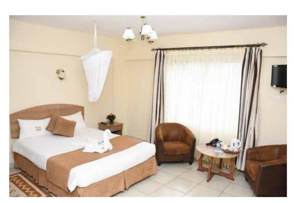
Executive accommodation rooms at Lower Kabete