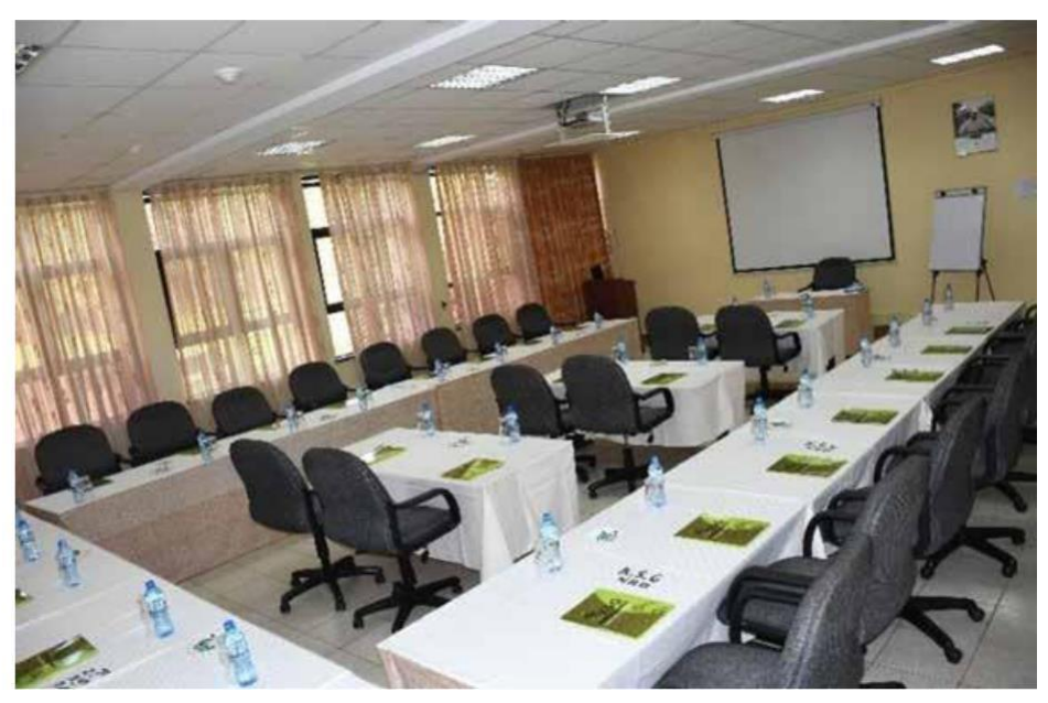
A training room at Lower Kabete