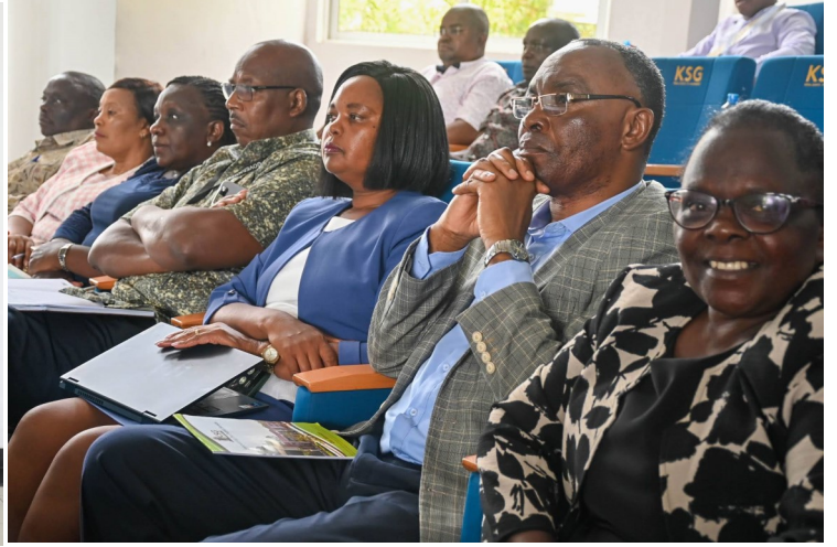
Directors from the Kenya School of Government follow proceedings.