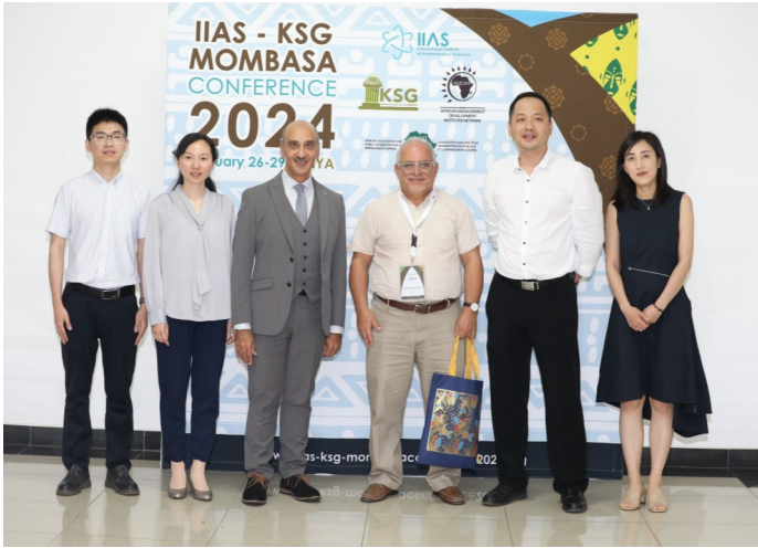
IIAS officials with delegates from the Republic of China at the Conference.