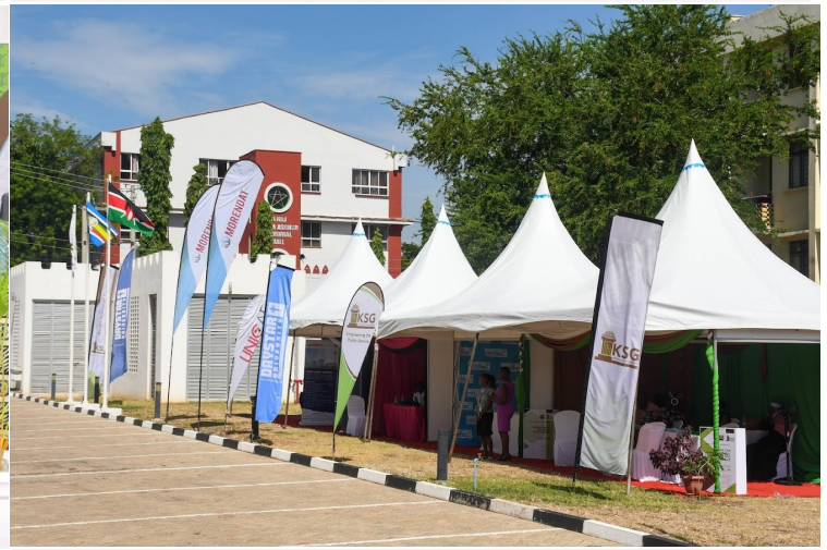
Exhibitors participated in the Conference by showcasing their products to delegates.