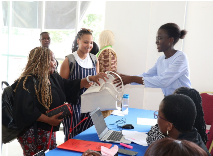
KSG staff assist delegates with the registration process at the beginning of the Conference.