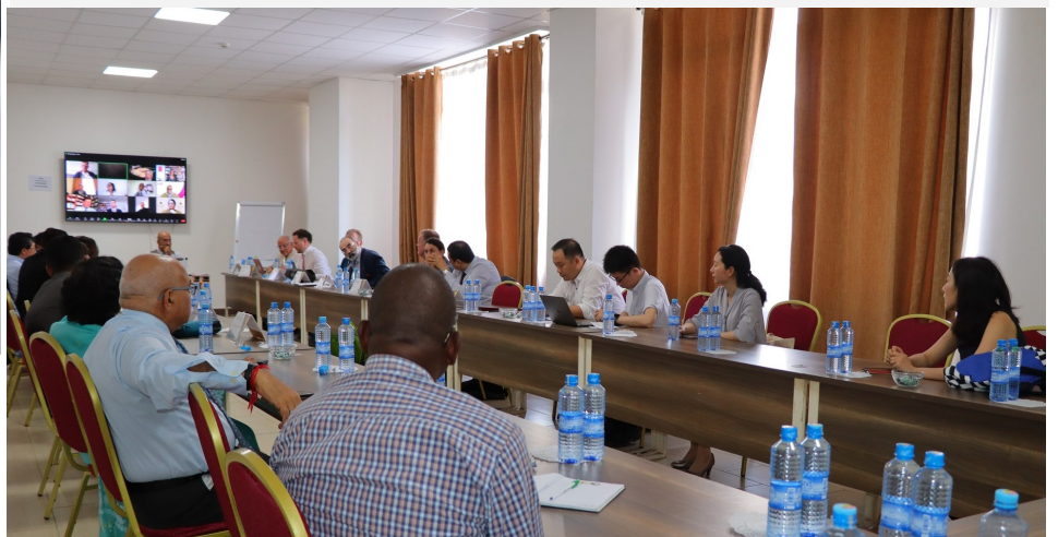
One of the break away sessions underway at the Conference. Delivery of this session was conducted in a blended manner- in person and online attendance.