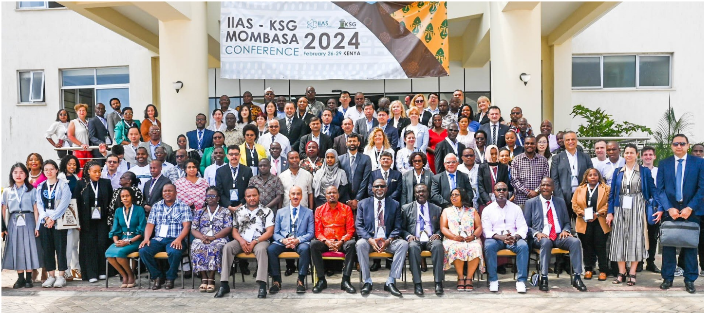
Hon. Moses Kuria (seated in red) Cabinet Secretary of the Ministry of Public Service Performance and Delivery Management, who officially opened the Conference on Tuesday, February 27, 2024, with all the delegates of the Conference and KSG Council and Management.

burden, inaccessibility to educational and healthcare programs, a low value-added technological development that could upset industrialization in developing countries and many other areas of concern.