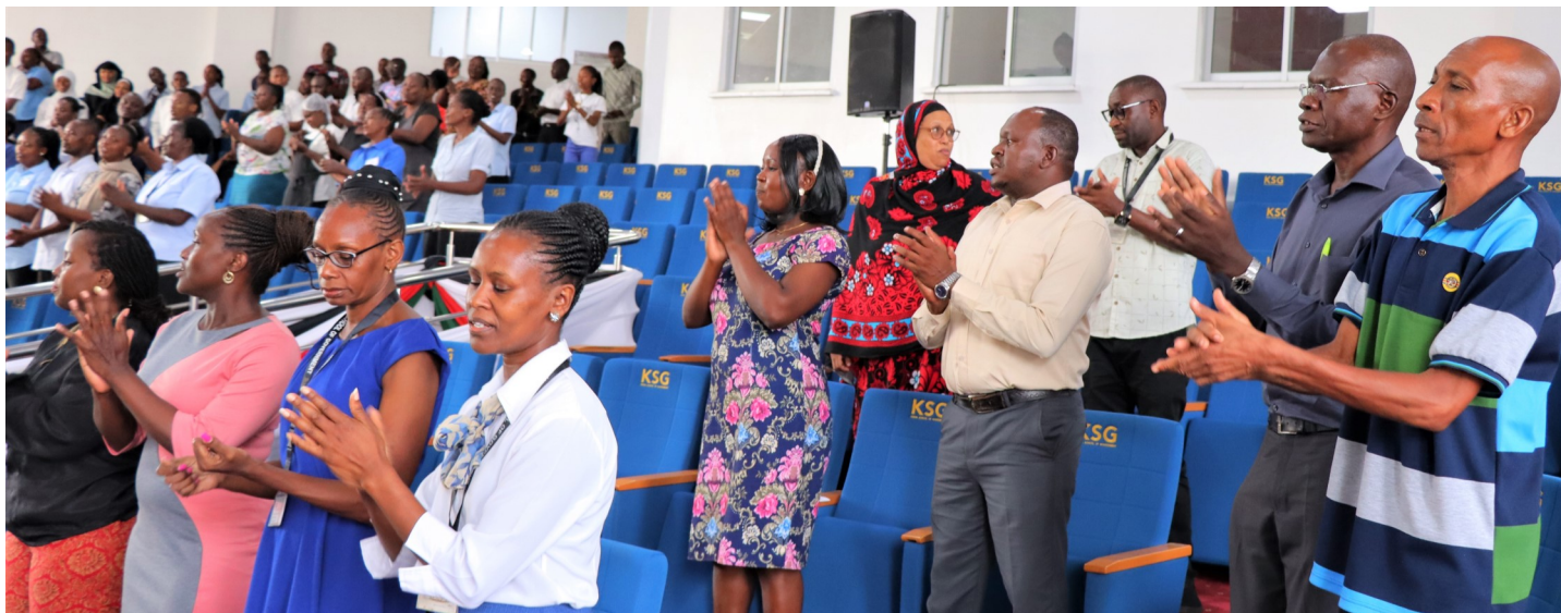
Mombasa Campus at the Prayer Day, a tradition of the School that is conducted across all campuses of the School . 2024, was no different, as the year was dedicated to God to set the tone for the following months.

The Director acknowledged the hard work, resilience, and camaraderie exhibited by her team in the last quarter, recognizing the sacrifices made by staff members above and beyond to spur their objectives despite the challenging conditions in the country.