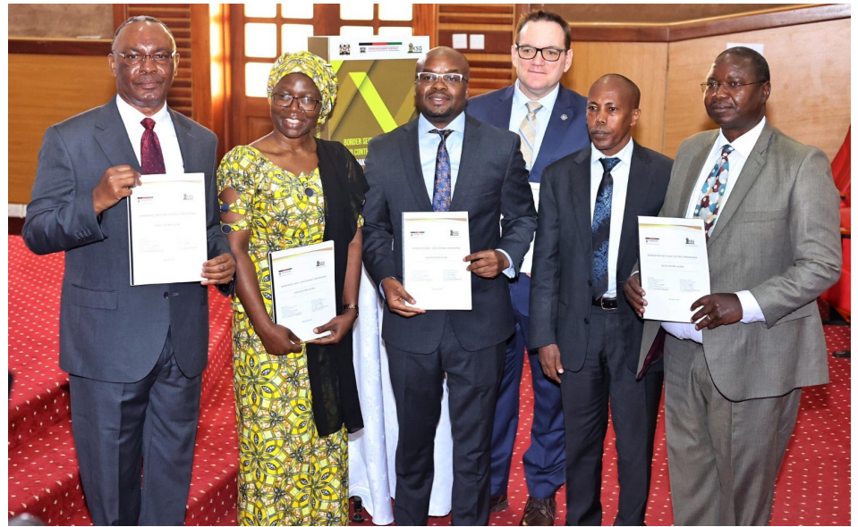
Dr. Raymond Omollo, Principal Secretary State Department for Internal Security, with officials from BMS, IOM and KSG display the curriculum just launched.

PS Omollo recognized that the program will play a critical role in realizing Government's commitment to securing the country amid rising threats across the region including terrorism. "The Curriculum we are launching today encompasses several dimensions of border management. It delves into the intricacies of border security, examining key terms, national interests, and their correlations to our cherished national