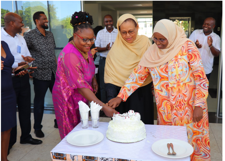
A cake cutting ceremony for the participants of Senior Management Course Cohort 176/2024 as they marked the close of the long month training at the Campus.

Finally, the floret signifies love; not just love for the knowledge and skills that have been multiplied, but also for the camaraderie forged and the network of colleagues established during the training. This endearing connection, like the roots that sustained the flower, promise to nourish and support the participants' future