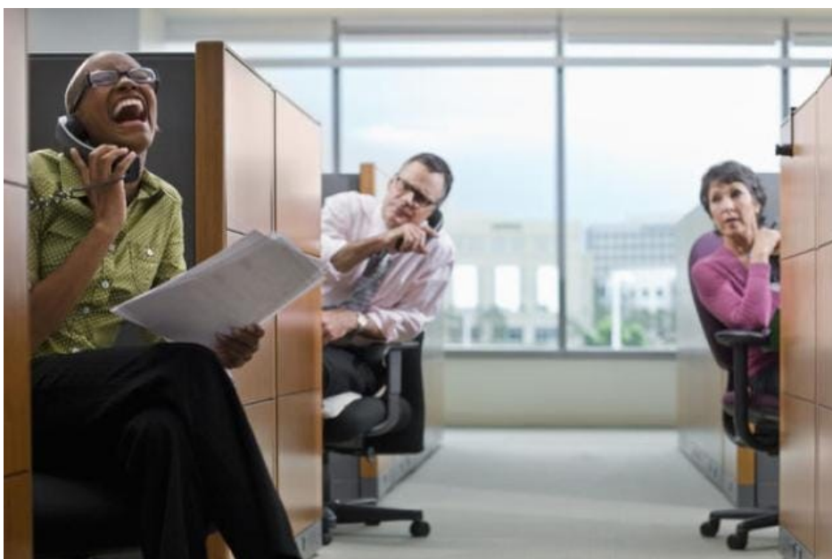
Picha ya hali isiyofaa ofisini kwasababu ya kelele kutoka kwa afisa mmoja.

Ni kweli kwamba wafanyikazi hutumia muda mwingi na wenzao kazini kwa hiyo haishangazi kwamba tabia fulani zinaweza kuanza kuchochea kwa njia mbaya. Katika hali hizo, inapendekewa u m j u l i s h e m w e n z a k o kinachokusumbua kwa njia iliyo wazi, ya kirafiki na ya adabu, na pia kuwa na subira iwezekanavyo. Kwani, inaweza kuchukuwa muda kwa watu kubadili mienendo fulani katika maisha.