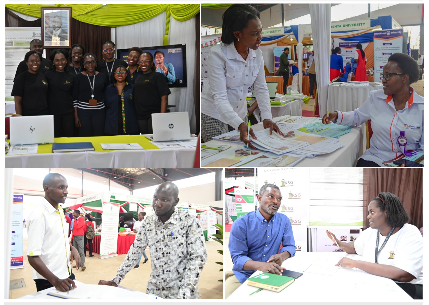
Kenya School of Government staff attend to clients at the International Trade Fair.