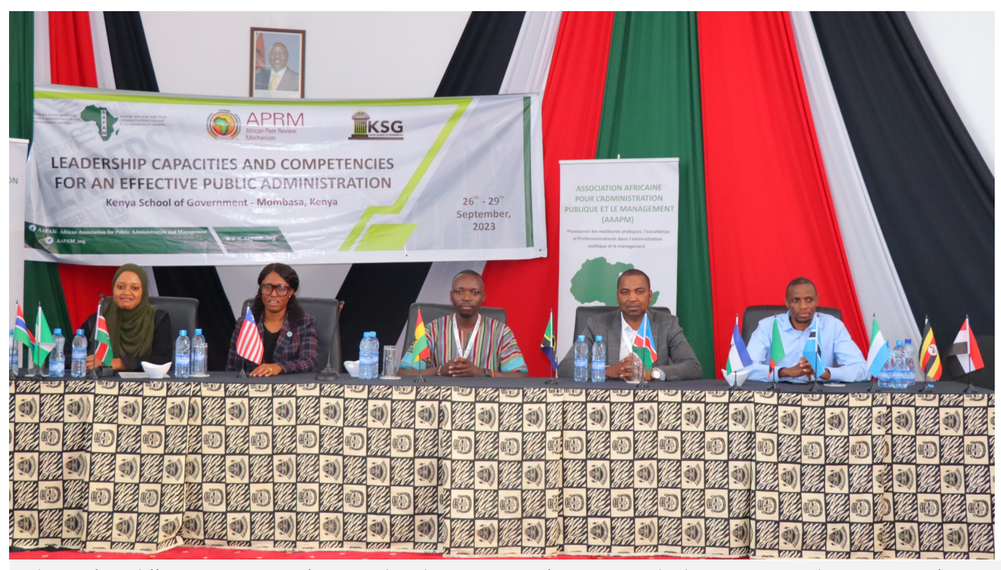
Delegates from different countries in Africa attending the AAPAM Conference on Leadership Capacities and Competencies for an Effective Public Administration at KSG Mombasa.