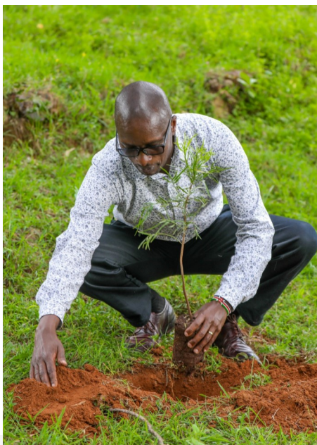
Tree planting was one of the activities that was carried out during the week.

During the whole week, all the customers who visited the