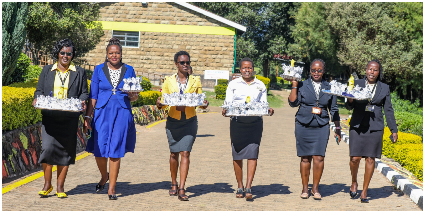
KSG Baringo Campus staff on their way to give service to clients and fellow employees at the start of the Customer Service Week 2023.