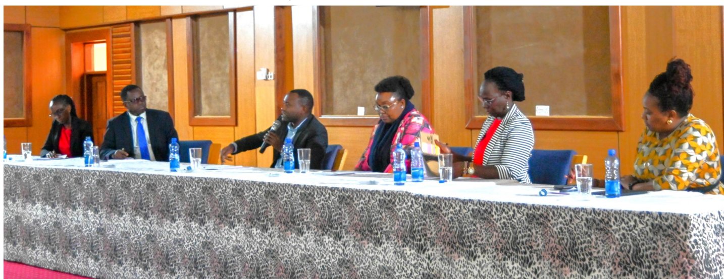
Panelist address the topic on Traditional Medicine into Mainstream Health Care during the Public Lecture organized by KSG Learning and Development in partnership with the Kenya Medical Research Institute, Centre for Traditional Medicine and Drug Research