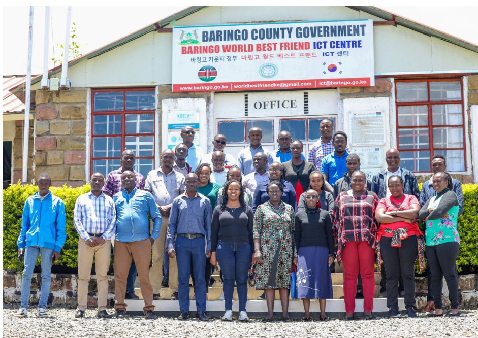
Senior Management Course Cohort 176/ 2023 during their field study tour at Baringo World Best Friend ICT Center

challenge by exposing learners in the Senior Management Course, among other courses, to field visits for them to understand intricate project management. The goal is to infuse research skills and build well-grounded managers in tandem with the contemporary needs of the Public Service.