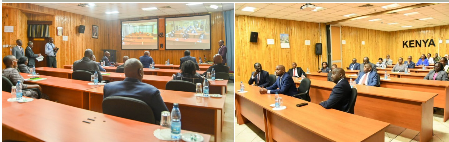
Led by the CS, the officials from the Ministry also toured School facilities. At the e-Learning and Development Institute (eLDI), the team was informed of the investment the School has made in modern information communication technologies that includes an air conditioned and sound proof video conference , multimedia room with high speed internet connectivity and a modern boardroom for group meetings.