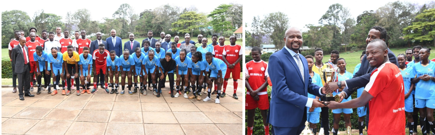
KSG Ogopa FC and Ogopalets FC was honoured to share a memorable moment with the Cabinet Secretary. The team provided a brief background of the club as well as the progress that they have made in the Kenyan Football League.