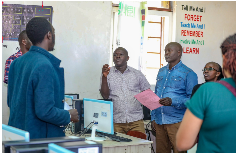
Participants engage the employees at the World Best Friend ICT to better understand the mode of operation for a sustainable project.

The ICT hub adopted a mode of operations where students