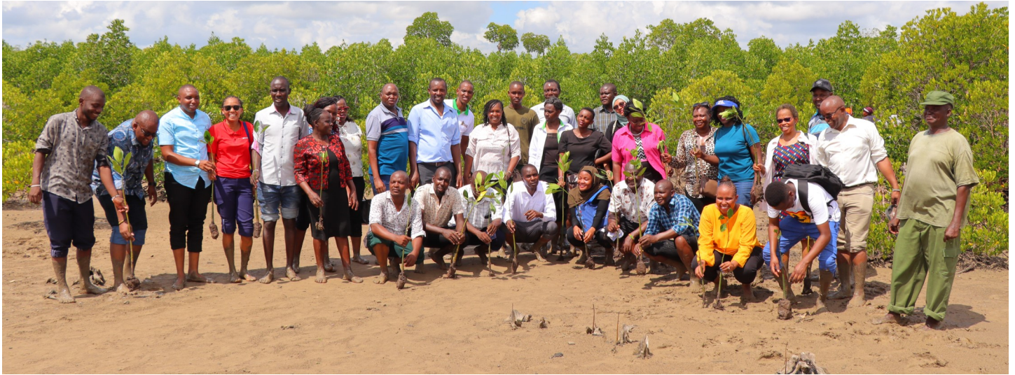
Staff and course participants of KSG Mombasa Campus at the Mkupe Conservation in Miritini in honor of the National Tree Planting Day on November 13, 2023.