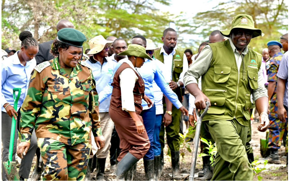
His Excellency President William Ruto leads the nation in the initiative to increase plant cover at Makindu, Makueni County during the National Tree Planting Day.