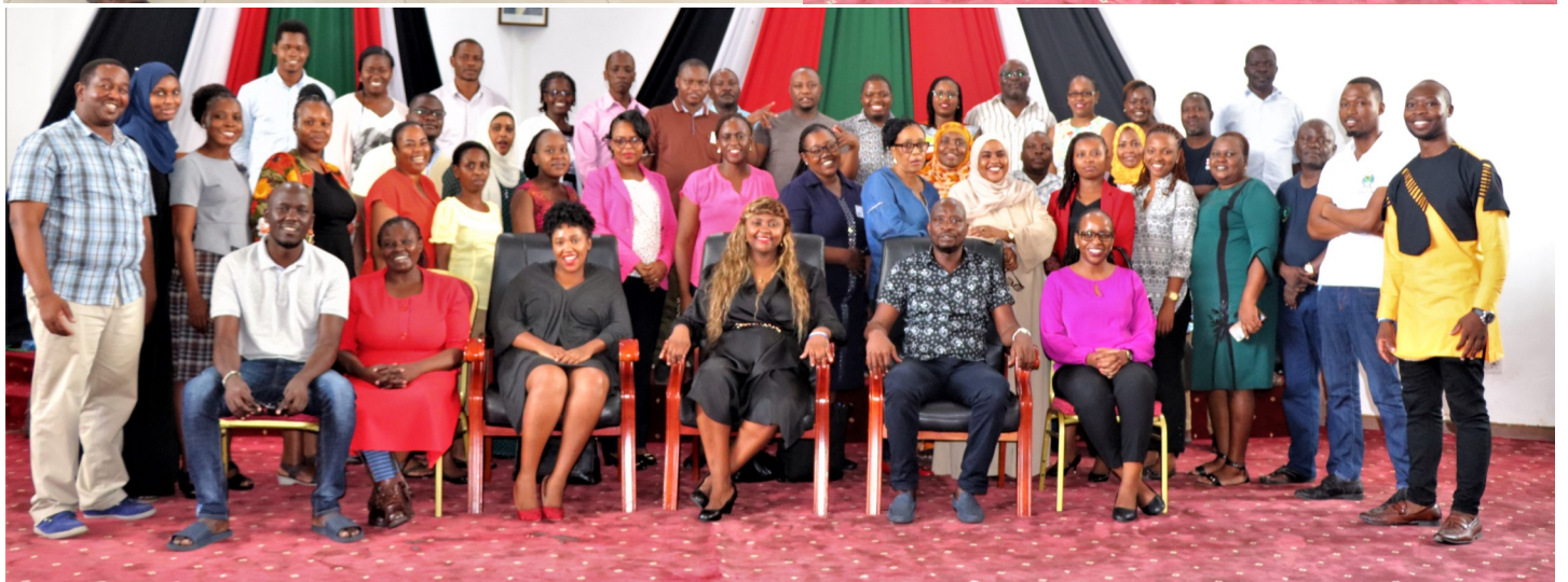
Participants of Senior Management and the Retirement Planning Courses at their joint graduation ceremony last week at Mombasa Campus.