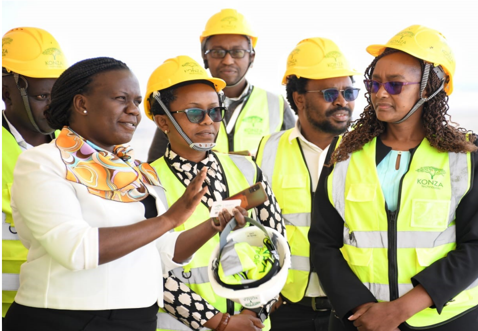
The Accounting Officers Program participants during the field visit at Konza Technopolis. The Program was conducted at the School from September 11- 15, 2023.