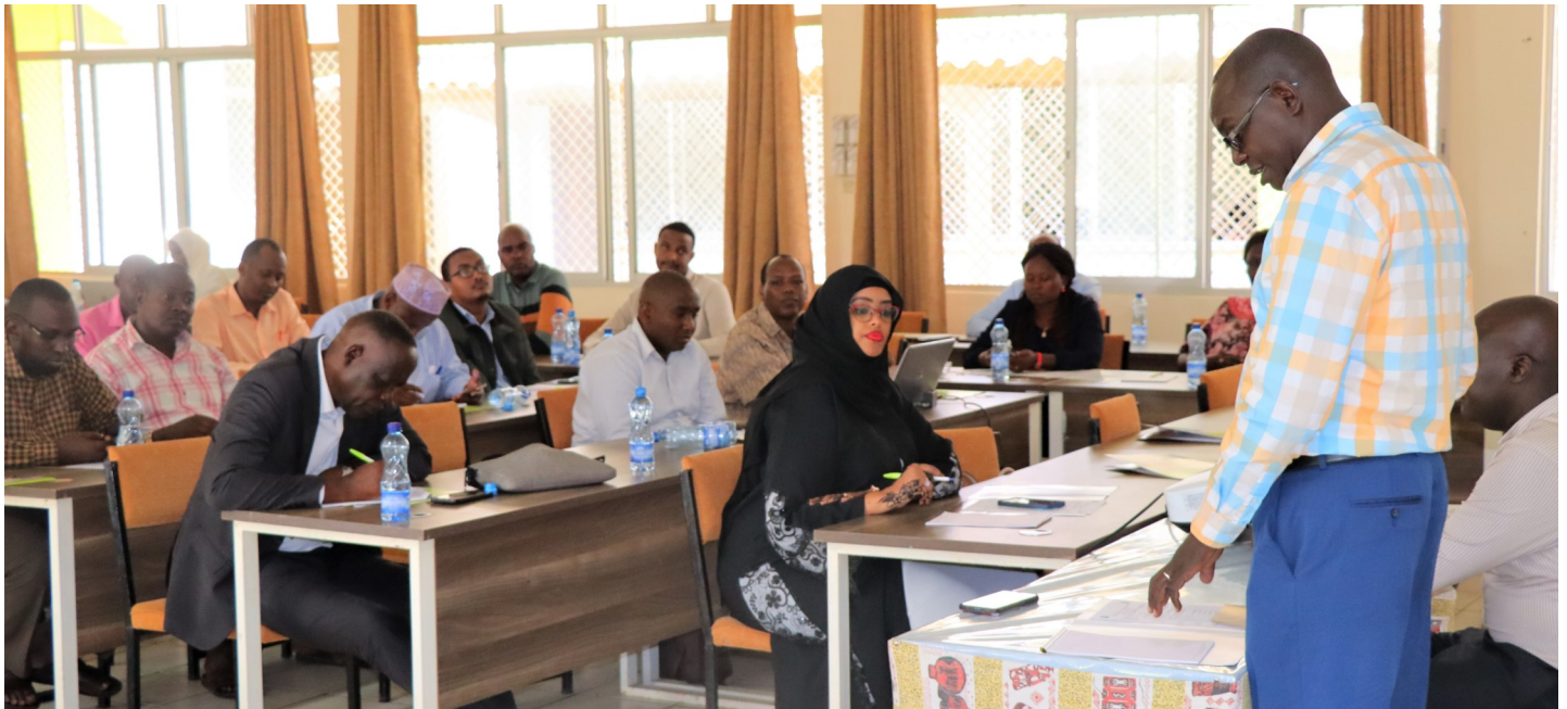
Participants from the Isiolo County Government attending the Performance Management Systems Course at the Mombasa Campus. Isiolo County's Deputy Governor, H.E. James Lowasa, officially opened the 5 day course .