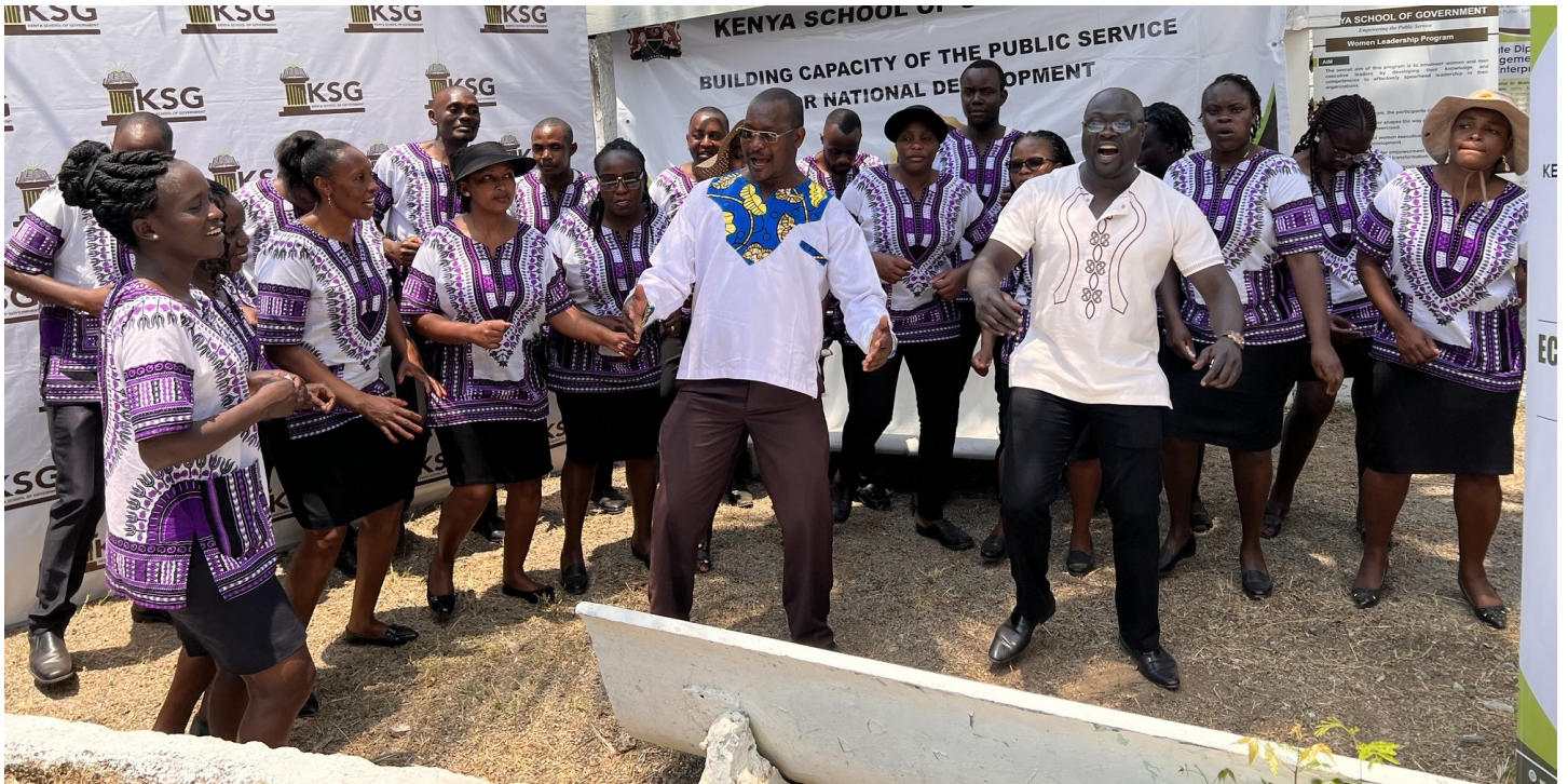
KSG Choir perform at the ASK Show in Mombasa, Mkomani Grounds