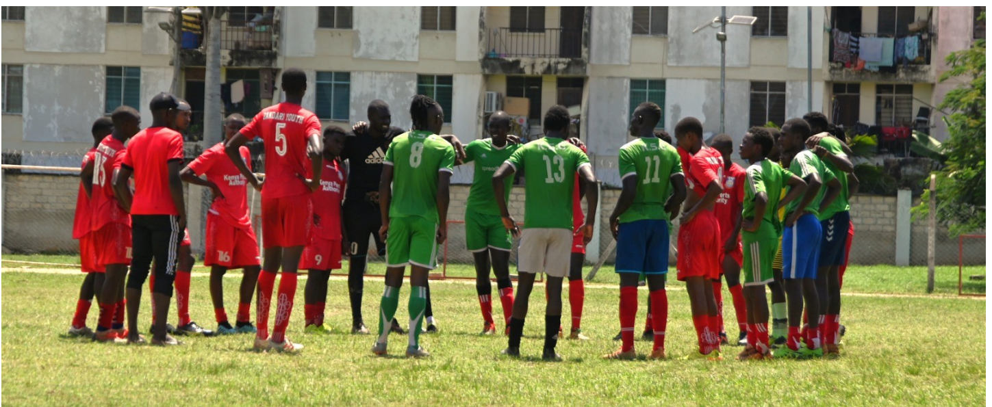
Ogopa FC players at Mwhima Stadium getting acquainted and ready for their face-off with SEZA FC. The team was at the Coast for pre-season tour for training sessions and friendly matches against well-regarded teams as part of the preparations for the up-coming 2023-2024 season.