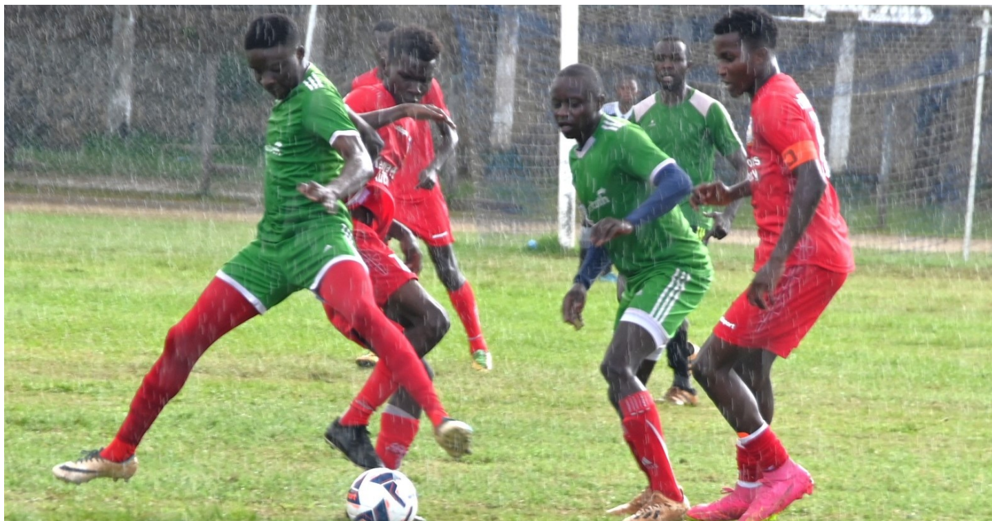
Even in the rain: KSG Ogopa players in action against Bandari Youth during a preseason tournament at Mbaraki Stadium in Mombasa County. Ogopa won 2-0 against the hosting team