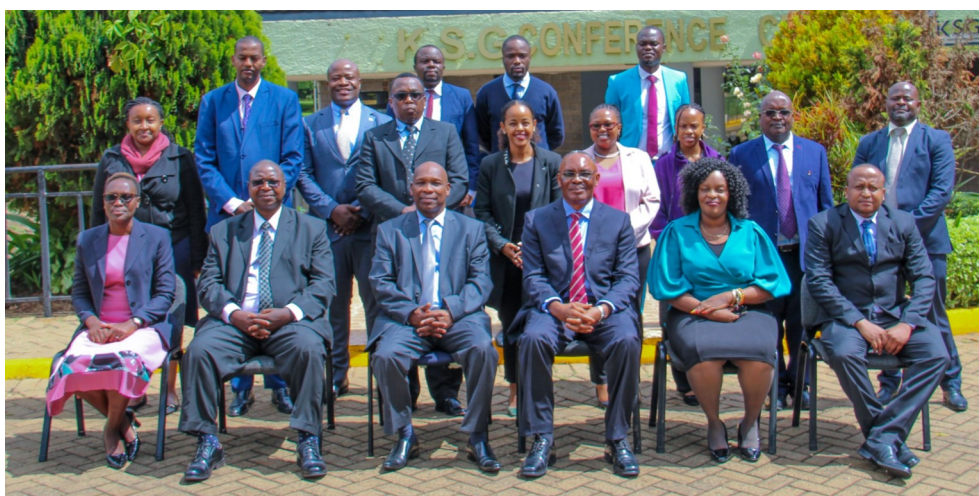
Border Management Secretariat (BMD) and the KSG -Security Management Institute (SMI) during a Validation Exercise to review the curriculum of the Kenya Coordinated Border Management Program (KCBMP) at Lower Kabete.