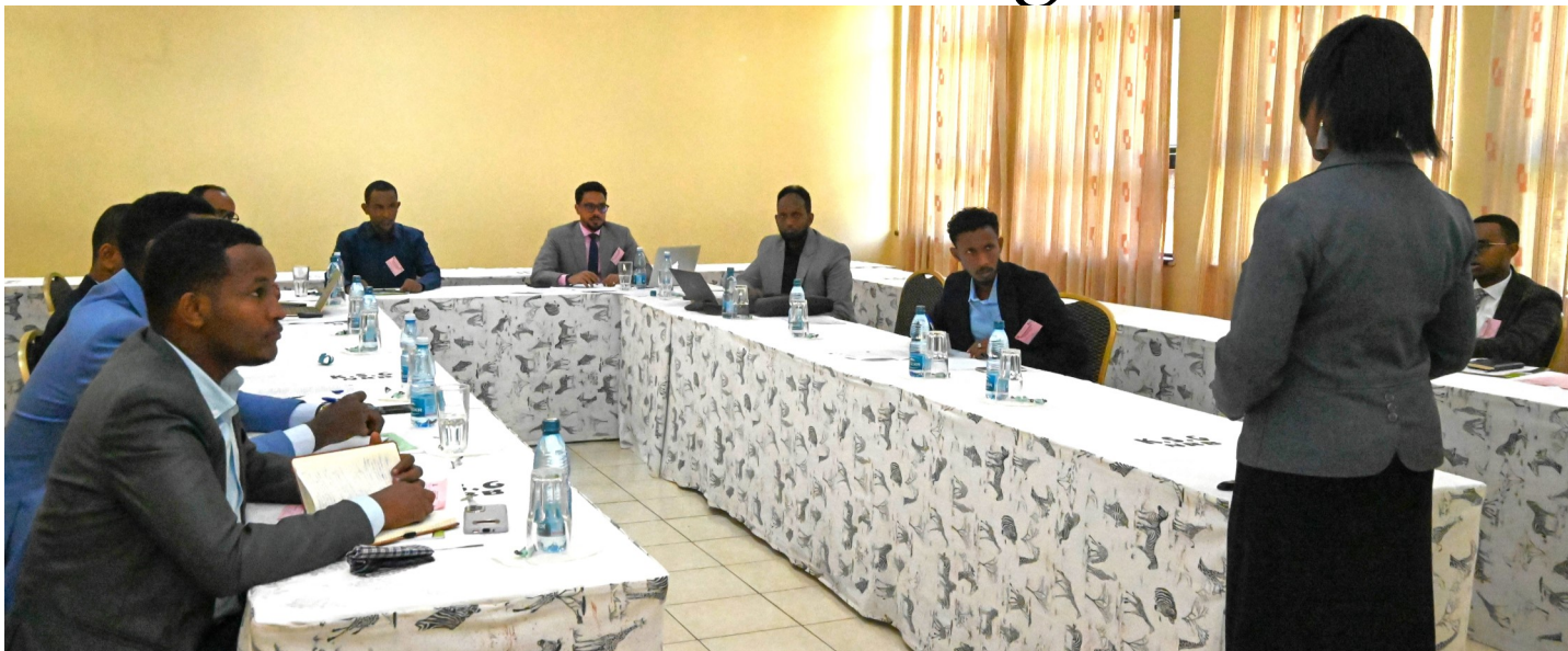
Participants from the Ministry of Finance and Parliamentary Budget Office of Federal Republic of Somalia who had attended the two weeks Training of Trainers program at the School in Lower Kabete.