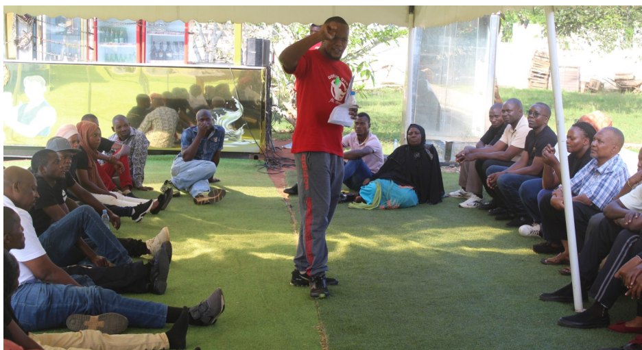
Matuga staff engage in a talk on mental health – a snapshot of teamwork, joy, and the pursuit of good mental health.

In turn, these benefits will go a long way in increasing the overall well-being of the workforce and increase the overall productivity of the Organization. Ultimately, investing in mental health in the workplace is indeed an investment in the organization's future outlook.