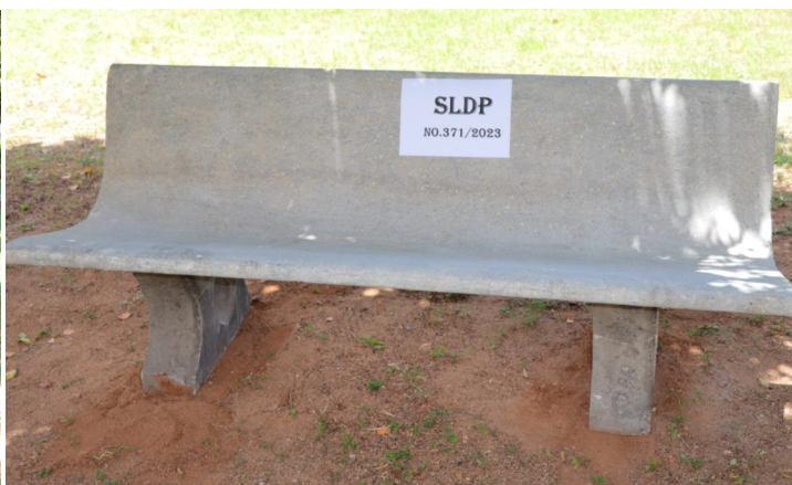
Course participants of the Strategic Leadership Development Program gift the School with outdoor seats, creating a shared space for staff and participants; a thoughtful contribution enhancing comfort