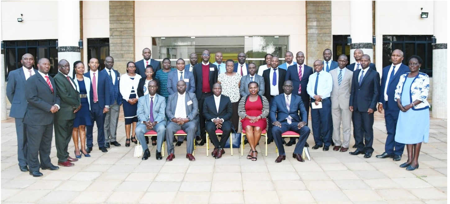
Senior Officials attending the Leadership Development for Public Sector Directors Program at the Kenya School of Government .