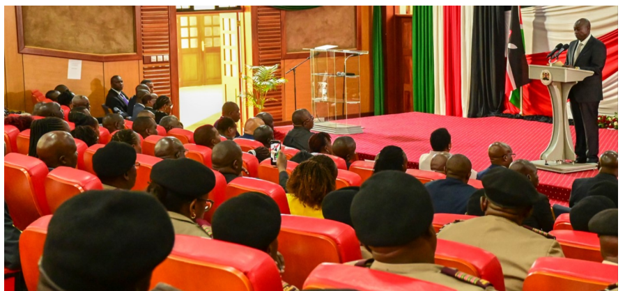
H.E Rigathi Gachagua addresses participants at the Program Launch of Phase II Farmers Registration and Inua Jamii Safety Net Program at the Kenya School of Government