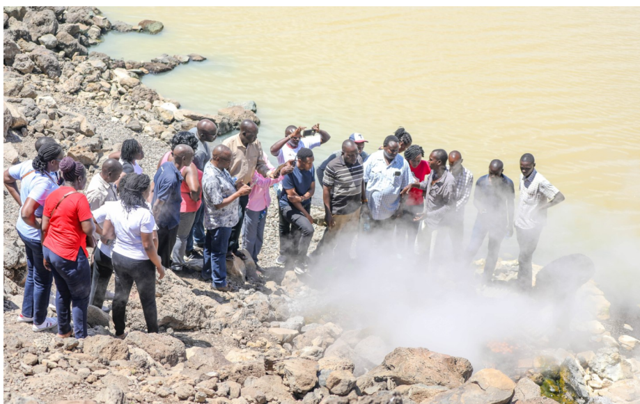
Participants of the Senior Management Course No 175 during their visit to the Hot spring at Kokwa Island, Lake Baringo.

Recently, Senior Management Course No. 175/ 2023 at KSG