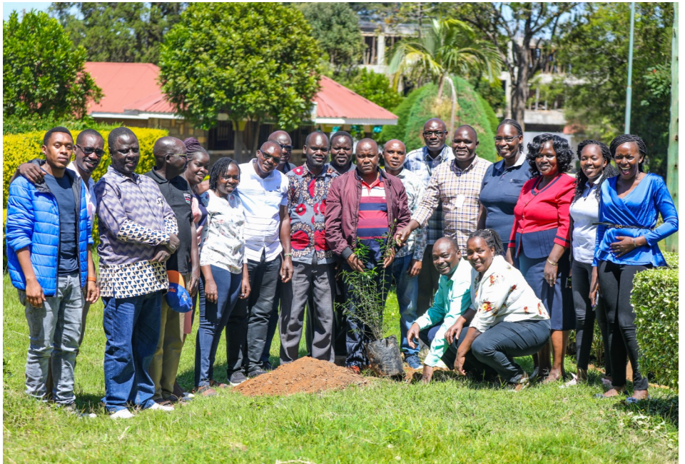
The participants also participated in a tree planting activity to immortalize their four-week stay at the campus

participants revealed potential vulnerabilities in the project; the borehole cover's construction proved inadequate, leading to gradual erosion over time due to exposure to varying weather conditions. Refurbishment or replastering is discernible to ensure its longevity and sustained functionality. The fence around the borehole requires strengthening to keep vandalism and compromising of the borehole's overall integrity at a bay. Additionally, the site exhibited neglect, with overgrown shrubbery encroaching upon the borehole area.