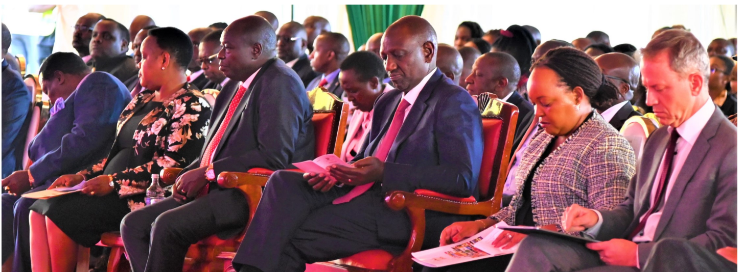
President William Ruto with delegates at the opening ceremony of the Conference.

Social Protection is one of the Sustainable Development Goals under people, planet and prosperity. It is also provided for in the Constitution of Kenya in the Bill of rights Article 43 (1) (a) which guarantees each Kenyan citizen the right to access the highest attainable standard of health including reproductive health care.