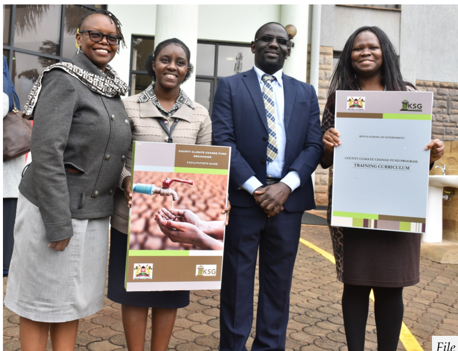
KSG's Centre for Environmental Governance and Climate Change staff during the launch of the County Climate Change Fund Program on August 4, 2022

According to the Fifth Edition of the Global Biodiversity Outlook Report and other scientific accounts, biodiversity deteriorates globally at an unprecedented rates despite efforts to halt the loss in past strategic documents, such as the Aichi targets of biological diversity. Specifically, the reports indicate that 25 per cent of plant