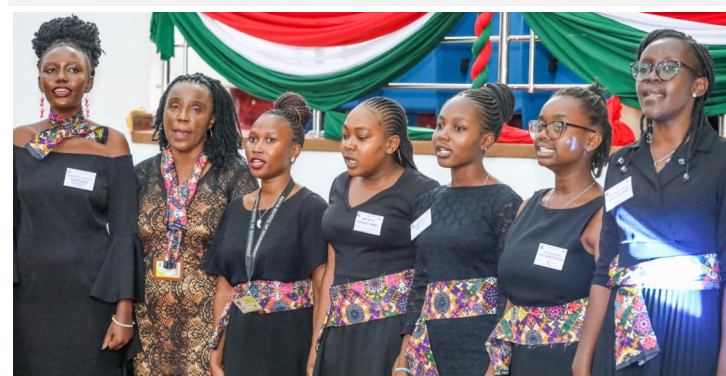
KSG Mombasa Choir sings the National Anthem, marking the beginning of the Program.