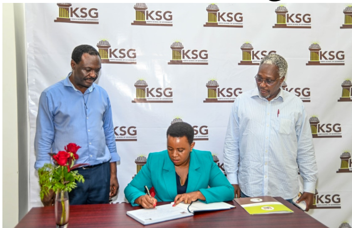
PS. Hon. Aurelia Rono, of Parliamentary Affairs pens the visitors book at Ultra Modern Facility. Hon. Rono officially opened the Program on behalf of H.E Musalia Mudavadi.