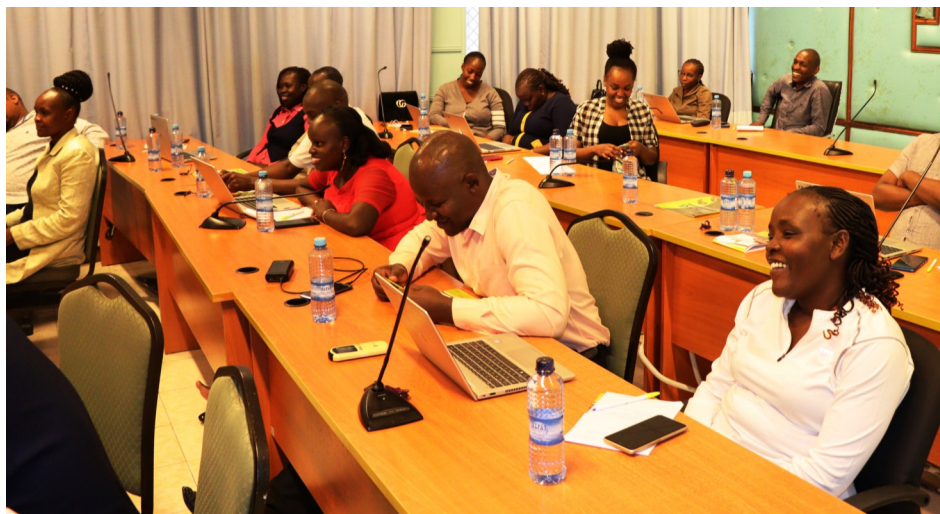
Machakos County officials undertake the Payroll Management Course at Mombasa Campus