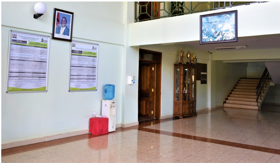
Kiswahili and English Service Charters on display at the KSG Lower Kabete Administration Block