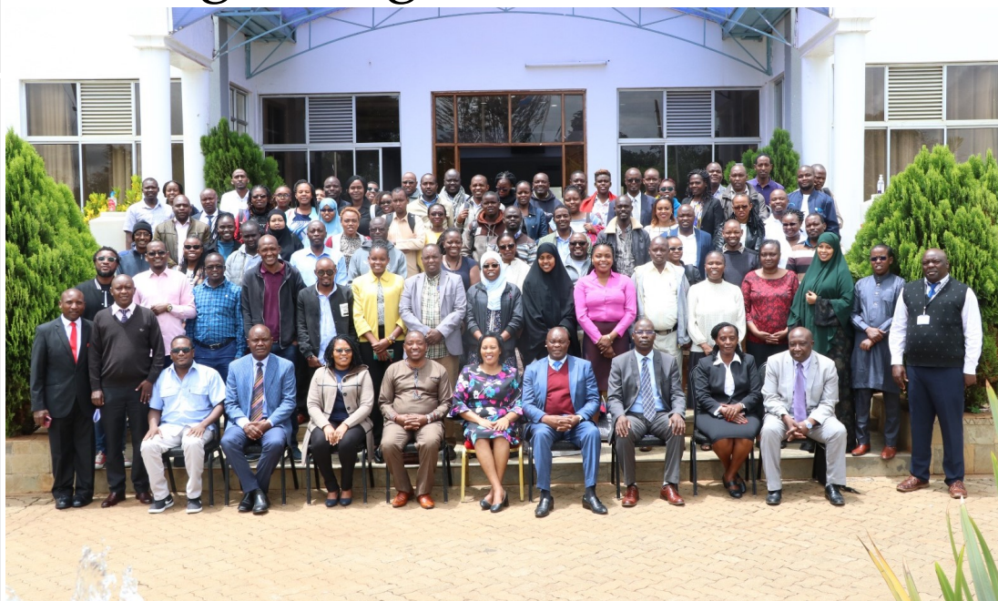
Participants of the Management of Child Protection Service Course at Kenya School of Government Embu Campus.