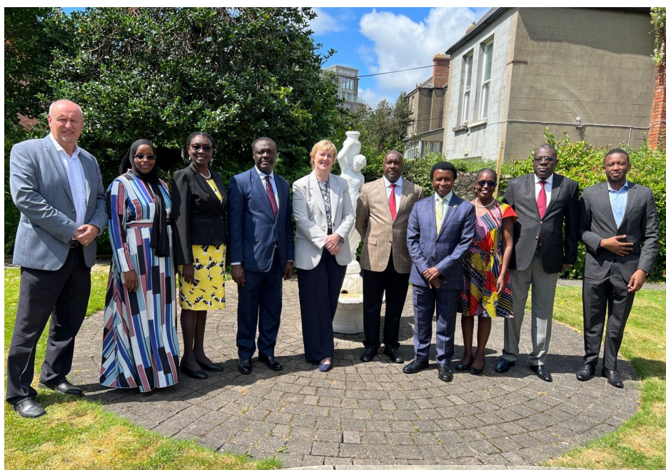
The Kenyan Delegation together with team from Ireland, at the Institute of Public Administration (IPA) for the benchmarking exercise.