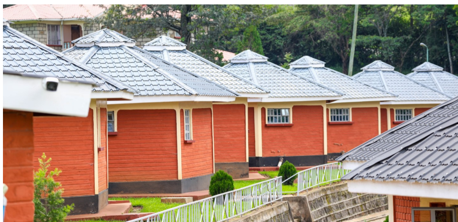
A view of Baringo's cottages offering executive accommodation