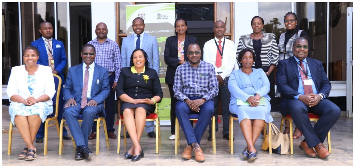
Embu Campus staff together with members of the Embu County Professionals Development Association (ECPDA). The Association seeks to partner with the Campus for enhancement of the County in various sectors.

Campus Director hinted at possible collaboration between the two entities especially in matters of training, research, consultancy, and advisory services, geared towards developing a concrete Strategic Plan for long-term implementation.