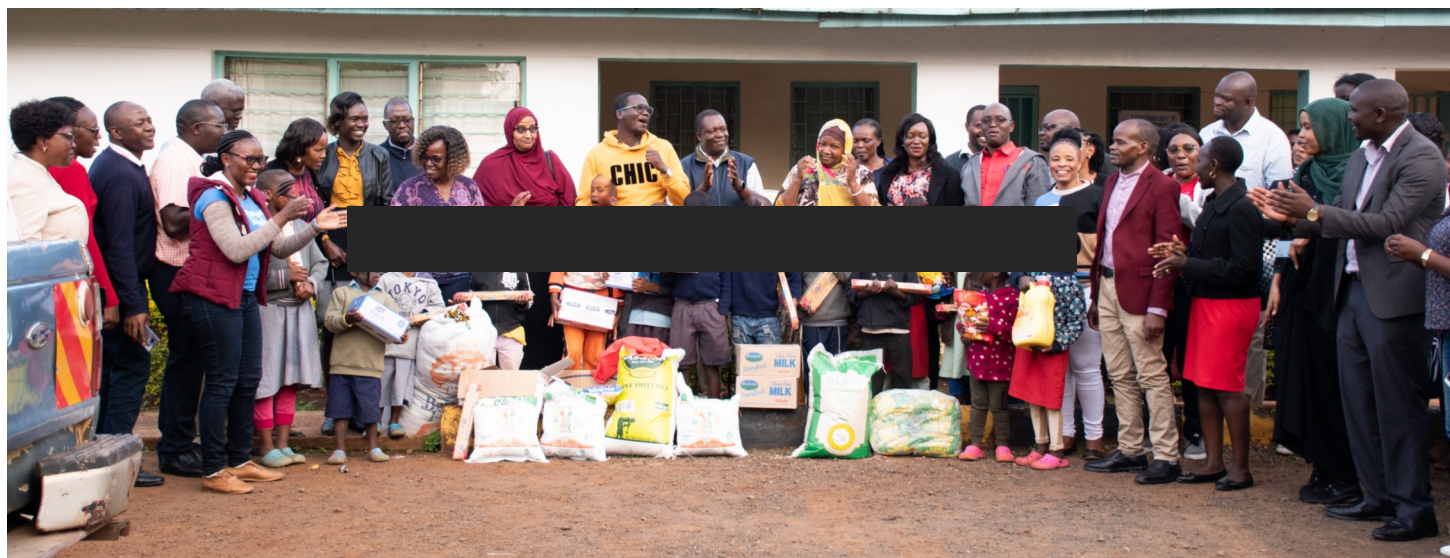
SMC No. 391/2022 participants with the children at Nairobi Children Rescue Centre during the CSR visit

The four weeks SMC course came to an end on December 1, 2022, with the next class scheduled to begin in January 2023.