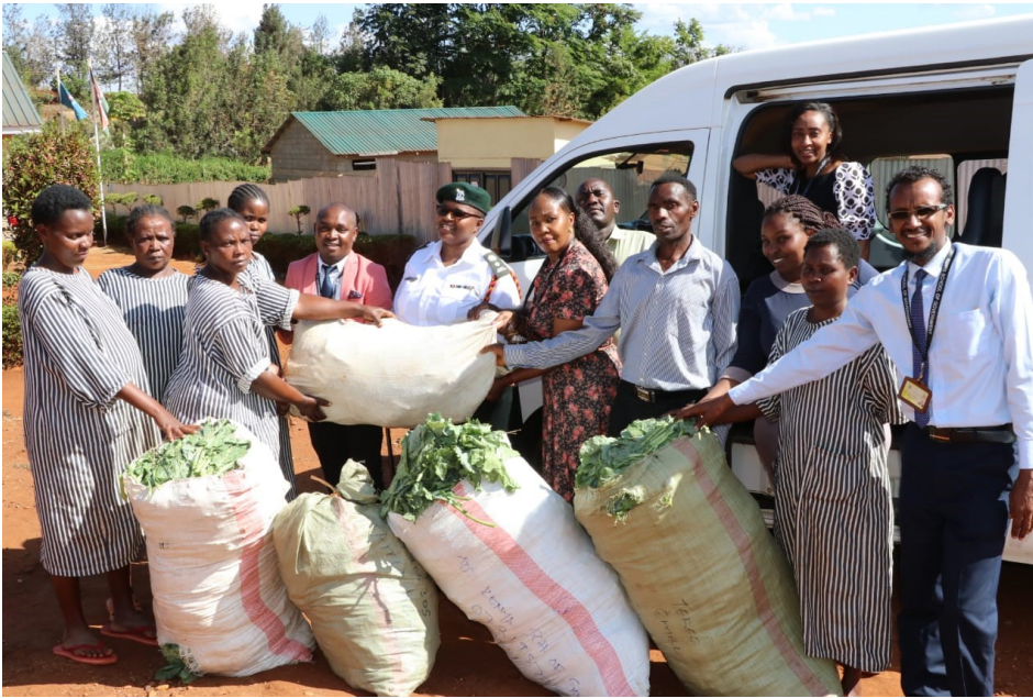
KSG Embu Campus donates fresh vegetables from their farm to the Embu Women's Prison as part of their Corporate Social Responsibility.