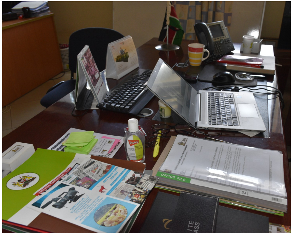
An image of a cluttered desk discouraged in security of documents and data.

The Clear Desk guidelines continue to emphasize that confidential, restricted, or sensitive information, when printed, should be cleared from printers immediately. Where possible, printers with a 'private