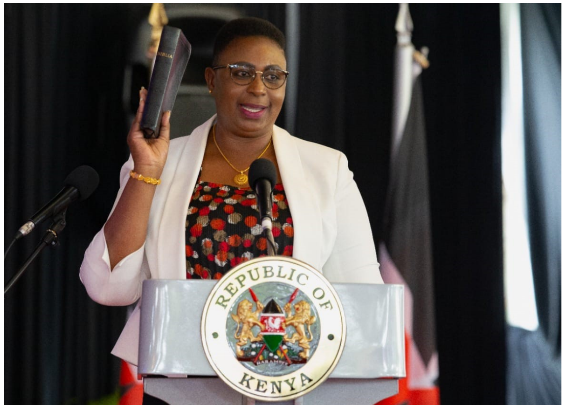
Hon. Aisha Jumwa, at the swearing in ceremony as Cabinet Secretary for the Ministry of Public Service, Gender and Affirmative Action.

Published by the KSG Communications Department