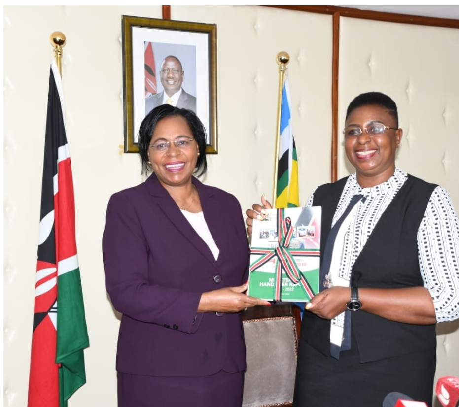
Outgoing Cabinet Secretary Prof. Margaret Kobia (left) handing over the Ministry of Public Service, Gender and Affirmative Action to the new Cabinet Secretary, Hon. Aisha Jumwa.

Staff Interviewed across the School have expressed excitement and great optimism in the appointment of Aisha Jumwa and look forward to her early visits to the Campuses.