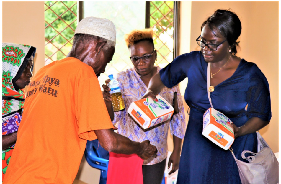
Participants of Senior Management Course cohort 159/2022 share food items with local residents of Mwakirunge in Kisauni at a time of major food shortage as persistent drought continues to affect families countrywide.