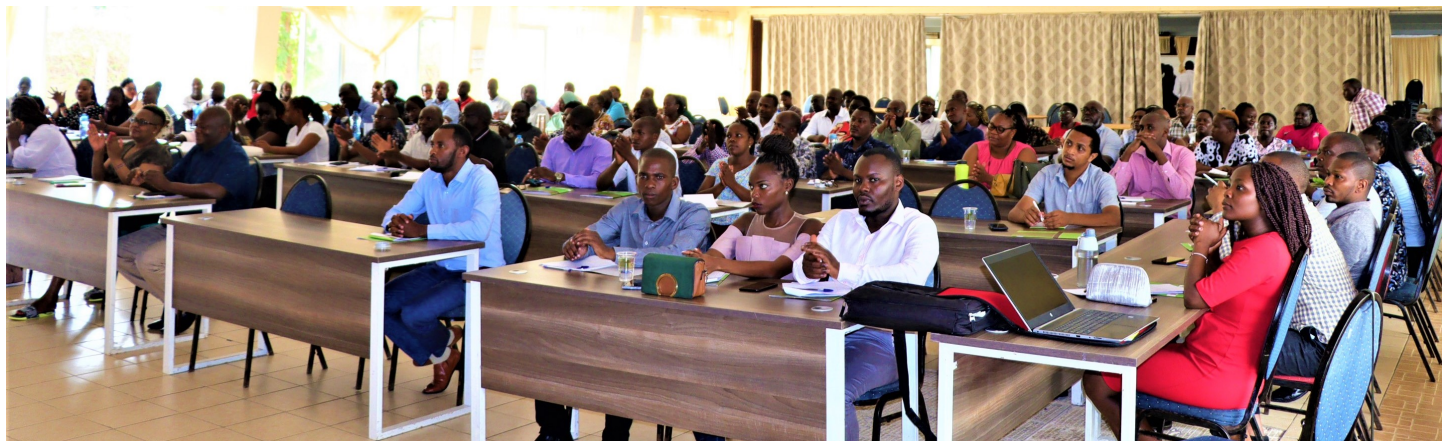
Supervisory Skills Development Course participants follow session proceedings at the Mombasa Campus.