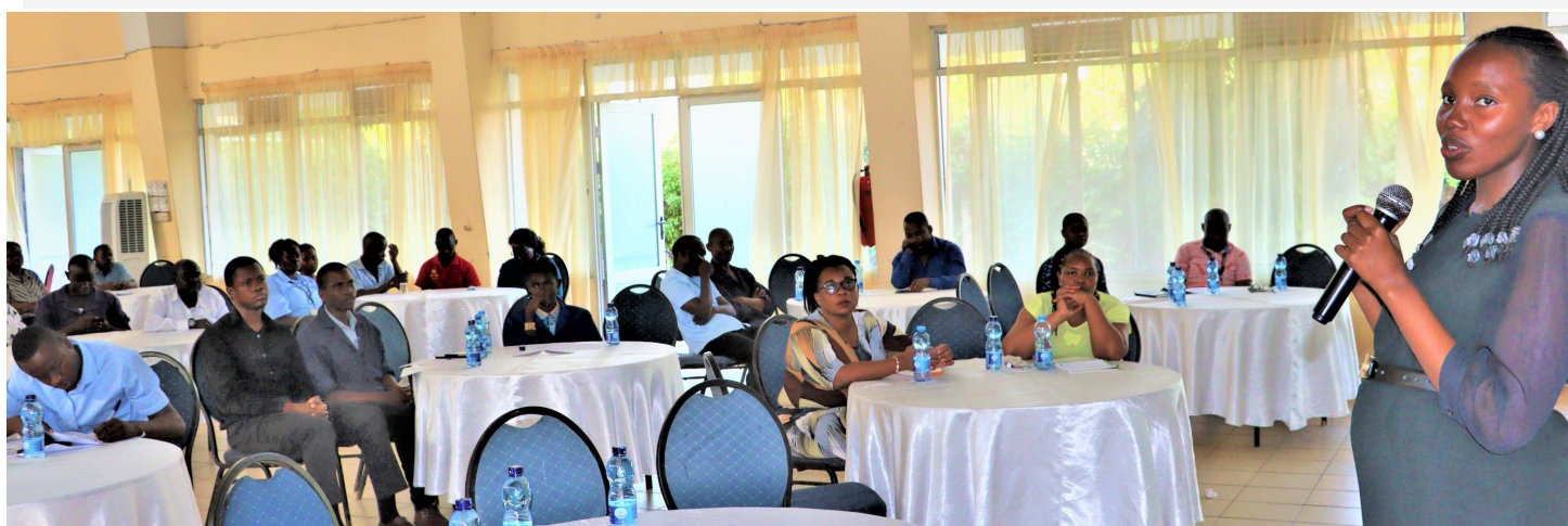
Staff of KSG Mombasa Campus attending a Mental Health Talk and Group Counselling Session which was facilitated by Chiromo Hospital Group.