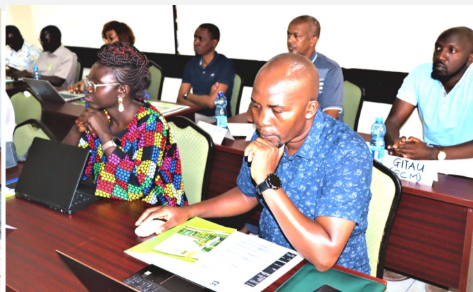
KeNHA's Integrity Assurance Officers convene for a Bribery and Corruption Risk Assessment and Mitigation Plans Development workshop at KSG Mombasa Campus.