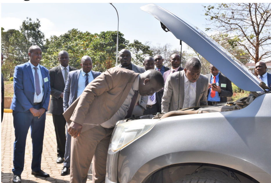
NCTC participants take part in a practical session, a module of the VIP Protection Course conducted by the Security Management Institute.

While the magnitude of insecurity may not be explicit, the consequences for un-preparedness can be catastrophic. For this reason, close protection officers and drivers are assigned to them to ensure their safety