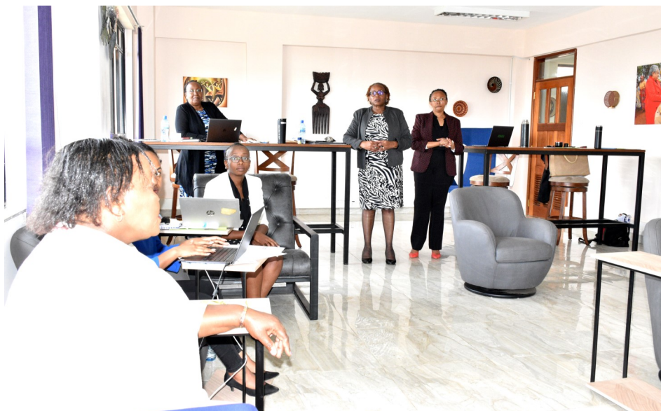
A session at the consultative workshop during the curriculum development at the Margaret Kenyatta Institute for Gender and Social Development, Lower Kabete.

"The well-being of employees affects the success of any organization. Good health is central to human happiness and well-being and therefore makes an important contribution to economic progress and a healthy population. Maintaining an