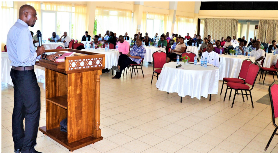
KSG Mombasa Campus Annual Prayer Day that was held on January 11, 2023. A day set aside for all staff and course participants to usher in the New Year on a spiritual note.