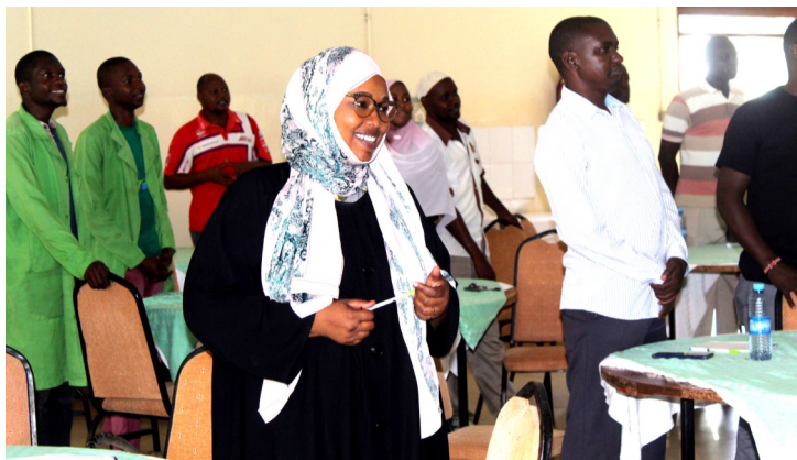
Matuga Campus staff during the Prayer day