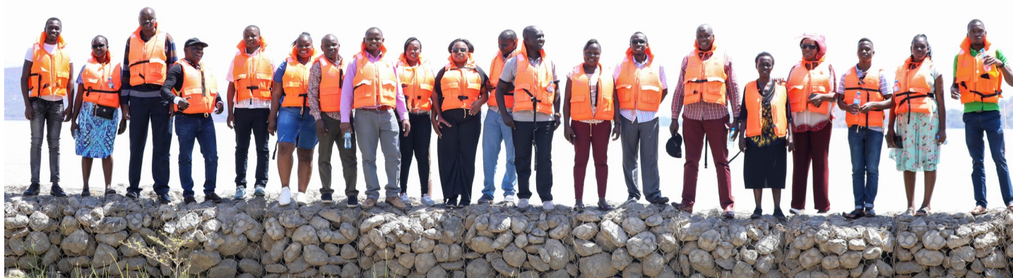
Participants of the Senior Management Course No. 165/ 2022 during their visit to Lake Baringo on Thursday, December 15, 2022.