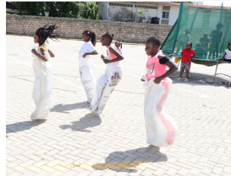
Images from Mombasa Family Fun Day: Tug-of-war, sack racing, song and dance were among many activities that both children and adults participated in. This provided a time of bonding and enjoyment for all who attended.