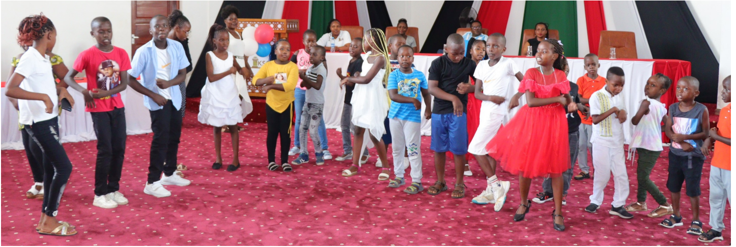
Children showcase their talents through dance at the Family Fun Day in Mombasa.