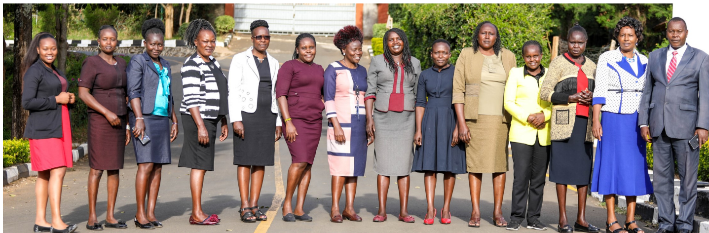
Public Relations and Customer Care Course participants at the Baringo Campus.