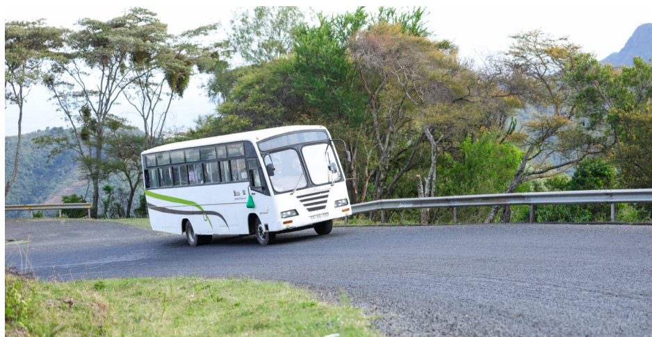
The Kenya School of Government bus on the Nakuru- Kabarnet B4 northbound road cruising along the Tugen hills serving travelers a taste of Kenya's beauty

Bring along a tracksuit for the trip day. Sunglasses are a must-have at the trip destination to keep your eyes safe from bright light while sunscreen lotion may be a critical addition to protect yourself from sunburn.