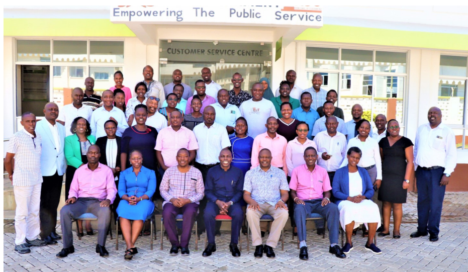
Participants of the fourth cohort of the Management of Child Protection Services Course that took place between November 28 and December 9, 2022

The program has an exam that will be used to gauge the understanding of the participants and how the skills acquired will be vital in their workstations. Besides, the course is a promotional factor in the career development of the officers.