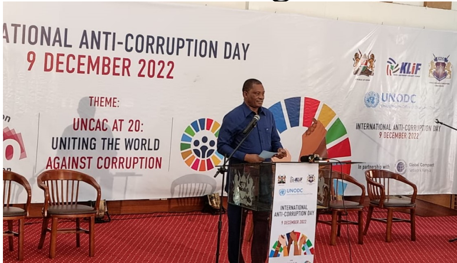
AG Hon. Justin Muturi, Chief Guest at the International Anti-Corruption Day delivers his key note address

that they committed to upholding the values written in the law. "The preamble of the Constitution reads that the people of Kenya adopt, enact and give this Constitution to ourselves and to our future generations. This is our Constitution, our law for us to uphold," he said.