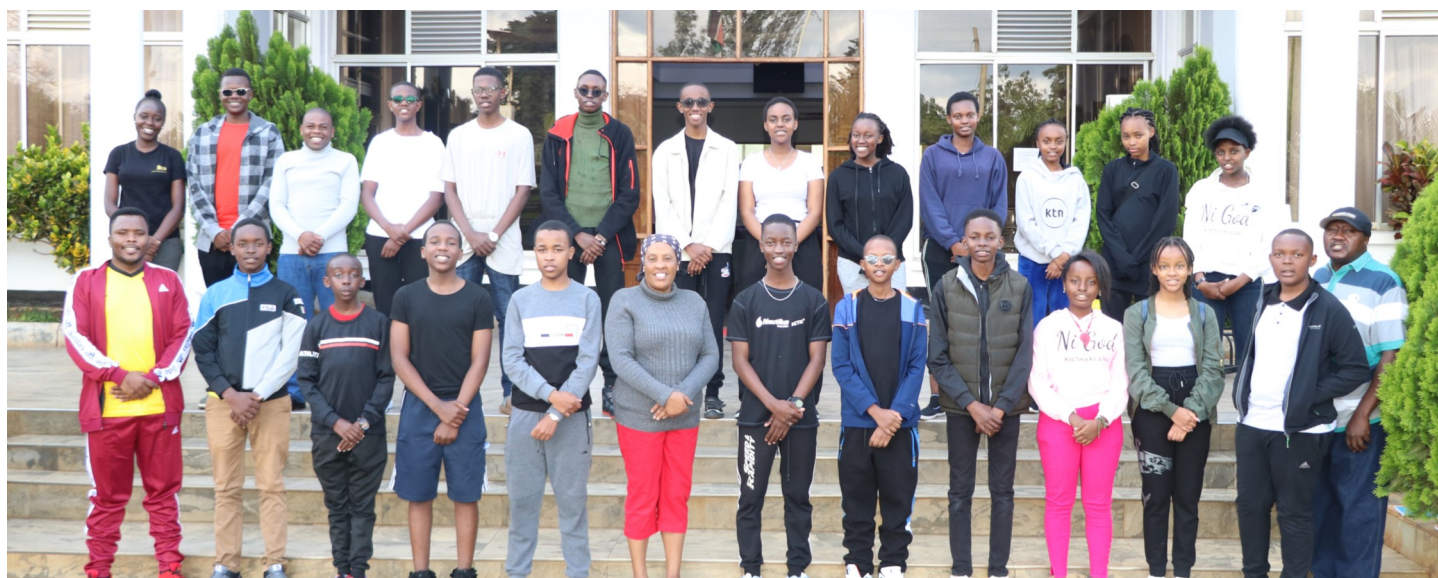
Alumni of Lions Primary School had a retreat at the KSG Embu Campus with an aim to sensitize them on drugs and substance abuse. The youth were also engaged in team building activities.